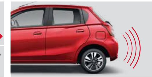
Reverse Parking Sensor

SMART We know what you need in your car. And have designed it accordingly.