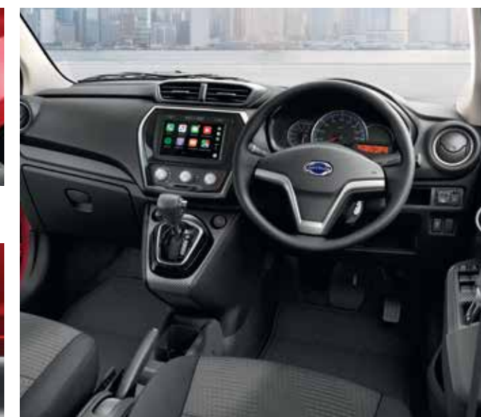
All-Black Premium Interiors