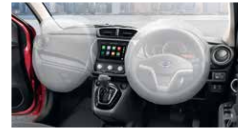
Dual Front Airbags

SAFE Make every drive a safe drive. The Datsun GO CVT is packed with next-generation safety features.