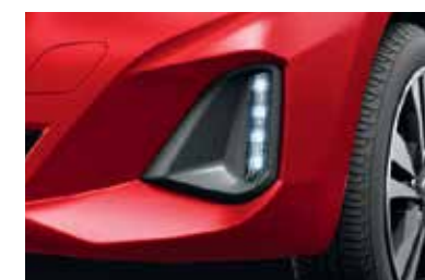
Stylish LED DRLs

STYLE Turn heads on the road with a dazzling range of new generation features.