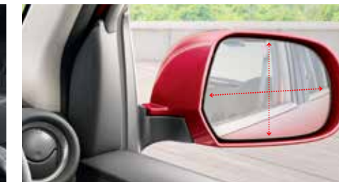
Electric Adjustable ORVMs