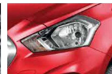
Headlamps with Follow-Me-Home Feature