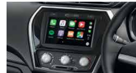
17.64cm (7.0) Touchscreen with Advanced Infotainment System

SMART We know what you need in your car. And have designed it accordingly.