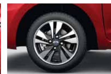
Diamond-Cut R14 Alloys