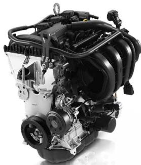
1.2l Ti-VCT Petrol Engine