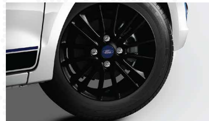
R15 (195/55 R15) Alloy Wheels

The sporty cellular grille gives a smart, bold look to the Ford Figo.