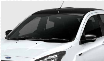
Dual Tone Roof

The Ford Figo's energetic design complements your personality and the hint of blue adds life to your world. Making it a smart match for you!