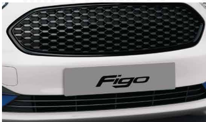
Sporty Cellular Grille

Contrasting colours on the roof make the Ford Figo a sight to behold.