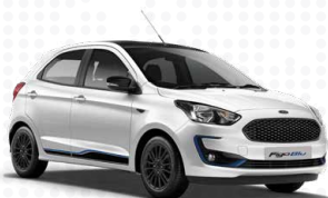
Figo Titanium BLU - Oxford White