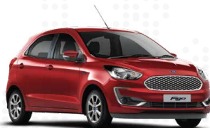
Figo Titanium - Ruby Red