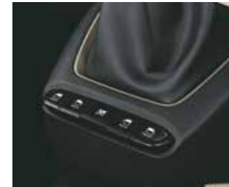
Ergonomically Positioned Power Window Switches