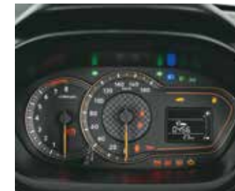
6.35cm Advanced Cluster with Multi Information Display (MID)