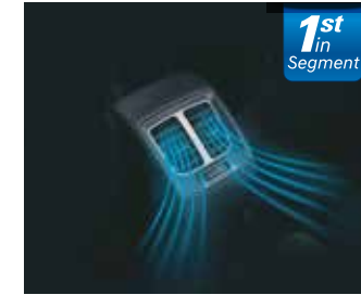
Rear AC Vents