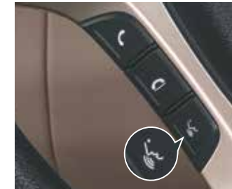
Voice Recognition Button on Steering