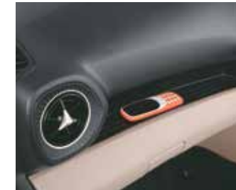
Practical Storage Area