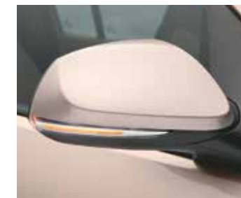
ORVM with Electric Adjustment & Turn Indicators