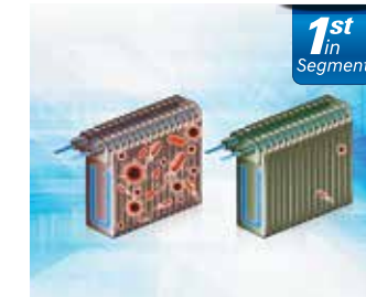
Eco Coating Technology