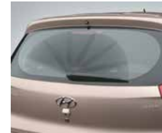
Rear Washer & Wiper