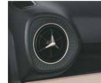
Unique Propeller Design Air Con Vents