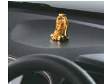
Idol Keeping Space