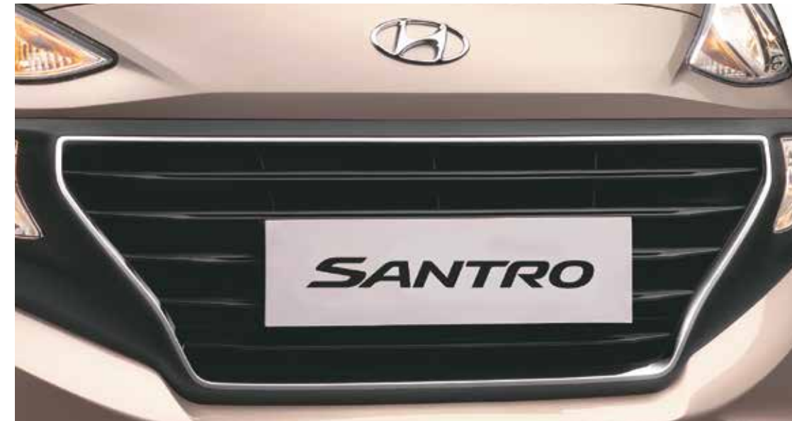
"Cascade design" Chrome Front Grille

Designed for the entire family's pleasure, the All New SANTRO comes with a modern design and a confident stance. While you relish its unmistakable Cascade Grille, high perched Fog Lamps, stylish Headlamps and Tail Lamps, let others admire the modern and unique Z-shaped character lines.