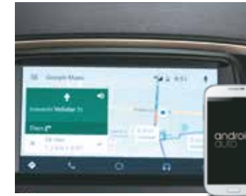
Android Auto Connectivity