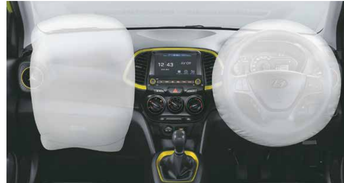
Dual Front Airbags