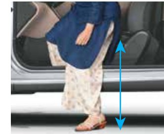
Spacious Cabin with easy Ingress/Egress