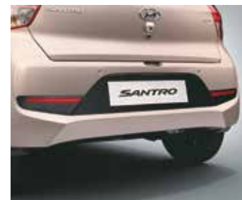
Dual Tone body color Bumpers with Reflectors

Body Colour Door Handles | R14 Steel Wheel with Cover | Z-Shaped Character Lines