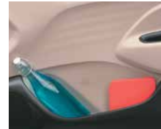
Map Pocket with 1l Bottle Holder