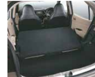
Rear Seat Bench Folding