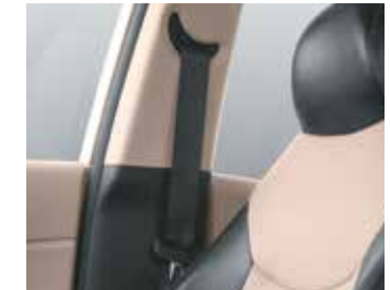
Front Seatbelt Pretensioners with load limiters