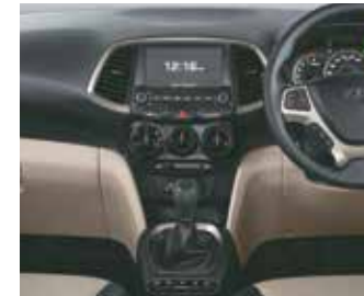
Elephant inspired Unique Centre Fascia

The All New SANTRO offers more room for the entire family and their growing needs. Now you will find long drives more enjoyable and less tiring.