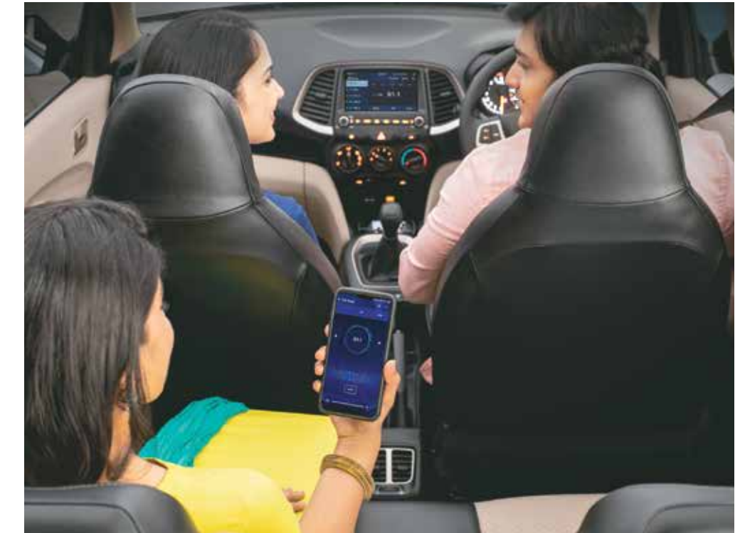
Hyundai iBlue Smart Phone App for Audio Remote Control*

Smart technology surrounds you in the All New SANTRO. It features 17.64cm Audio Video System with Smart Phone Connectivity, Voice Recognition & Navigation through Smart Phone and Eco Coating Technology.