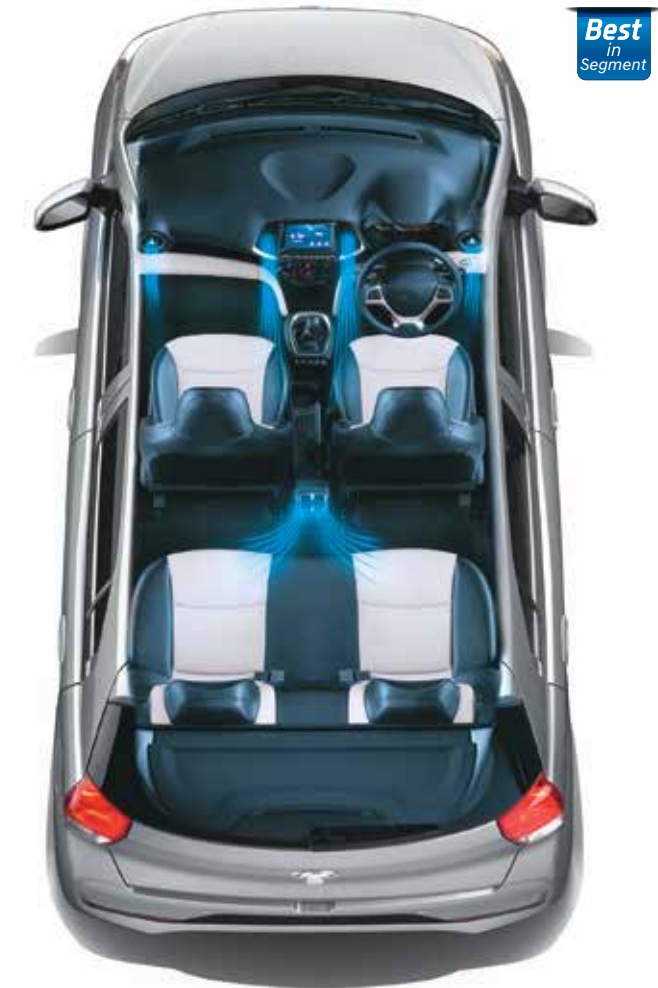
Superior AC Performance

Floor Mat Hook | Passenger Vanity Mirror