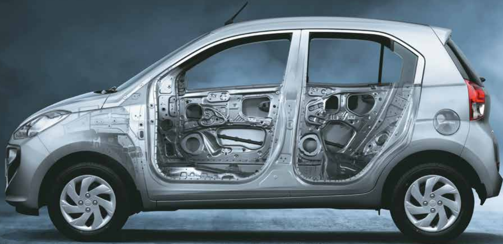
Strong Body Structure (63% AHSS+HSS)