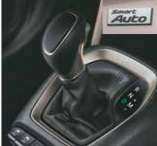
Smart Auto AMT