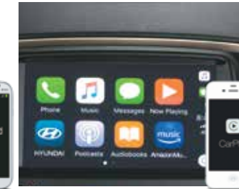
Apple CarPlay Connectivity