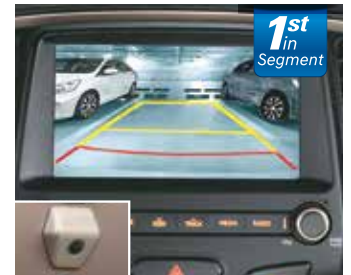
Rear Parking Camera with display on 17.64cm Audio Video Screen