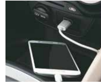
Power Outlet & USB Port

The All New SANTRO is thoughtfully designed for the comfort and convenience of your loved ones. Its ergonomically crafted interiors with Champagne Gold inserts and a host of features enhance the overall driving experience.