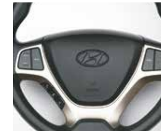
Steering mounted Audio & Bluetooth Controls