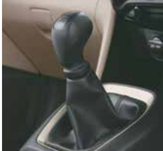
5-speed Manual Transmission