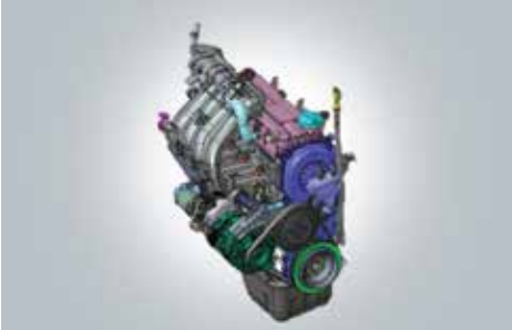
4 Cylinder Petrol Engine