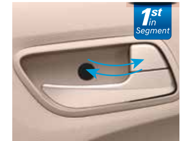
Speed Sensing Auto Door Lock & Impact Sensing Auto Door Unlock