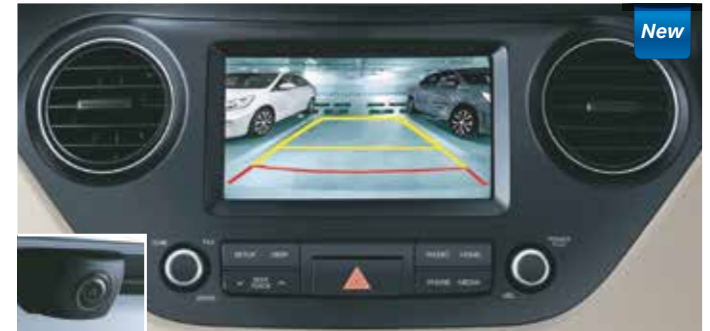
Rear Parking Assist System (with Display on 17.64cm Audio Screen)