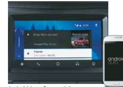
Android Auto Connectivity