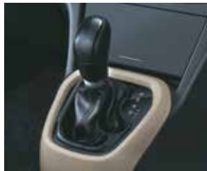
4-speed Automatic Transmission