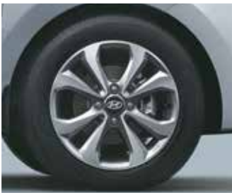
R15 Diamond Cut Alloy Wheels