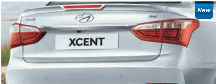
New Sporty Boot Lid Spoiler and Premium 2-Piece Wraparound Tail Lamps