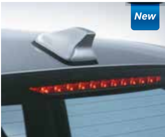
Shark Fin Antenna