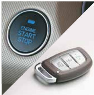
Smart Key with Push Button Start-Stop