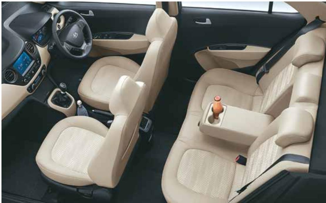
Bright and Spacious Interiors with New Seat Upholstery