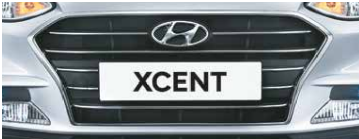
Hyundai Signature Cascade Design Grille with Chrome Slats

Rear Chrome Garnish | Electric Folding ORVM with Turn Indicator