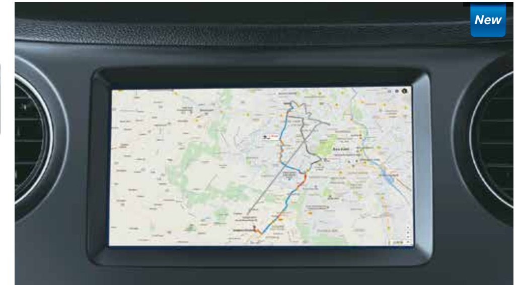
17.64 cm Touchscreen Audio Video System | MirrorLink | Smart Phone Navigation