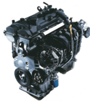
1.2L Kappa Dual VTVT Petrol Engine