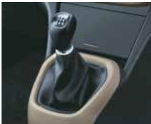
5-speed Manual Transmission

Whether you are negotiating the rush hour in the city or cruising on the highway with your family, the XCENT performs to perfection. With state-of-the-art petrol and diesel engines, it is highly responsive and very efficient.