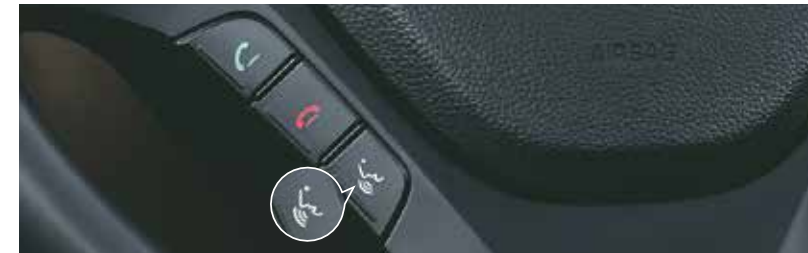
Voice Recognition Button on Steering