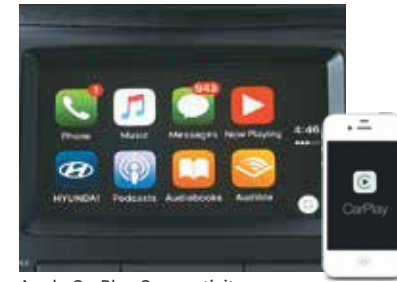
Apple CarPlay Connectivity