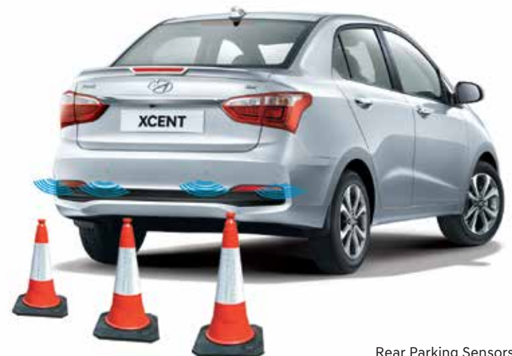
Rear Parking Sensors