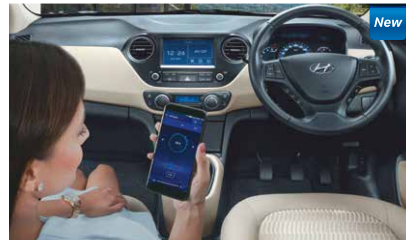
Hyundai iblue Smart Phone App for Audio Remote Control*

A class-leading 17.64 cm Touch Screen Audio Video System with smart phone connectivity, voice recognition and navigation support, gives the XCENT an advanced hi-tech imagery.