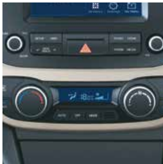
Fully Automatic Temperature Control