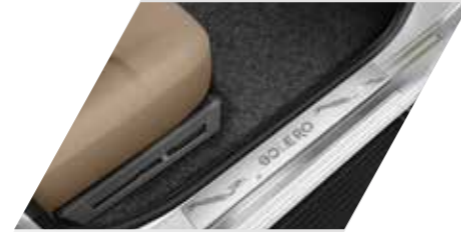
Special Edition Scuff Plate Set

Deck the vehicle with the meticulously designed accessories to get complete control and comfort to take on the tough roads ahead.