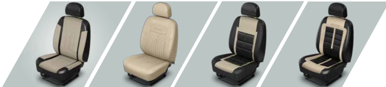
Beige Black PU Seat Cover

Also Available: • Full Floor Lamination Mat • Black PVC Floor Mat