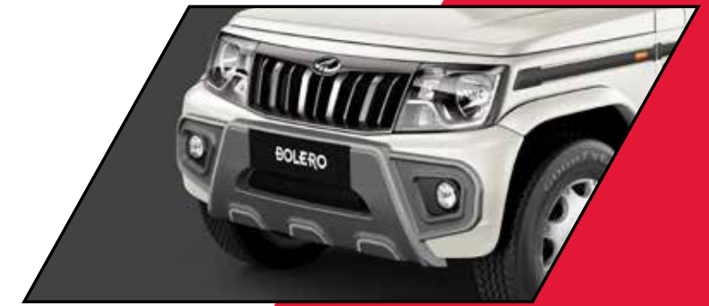
Front Bumper Add On