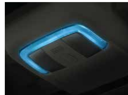
ICY-BLUE LOUNGE LIGHTING