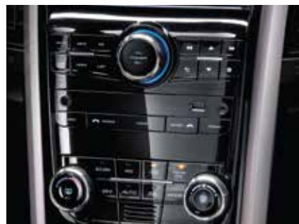
NEW PIANO BLACK CENTRE CONSOLE