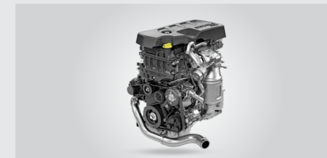
DDiS 225 (1.5L) Diesel Engine Optimizes power for a smooth drive.