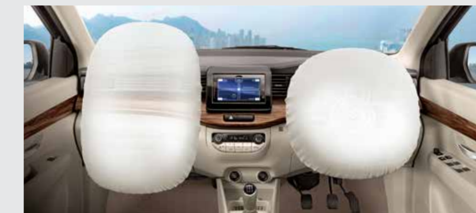
Dual Airbags Absolute safety for everyone.

Ertiga is based on the solid Heartect Platform which employs high-tensile steel at all the right places to improve overall safety, rigidity and NVH performance.