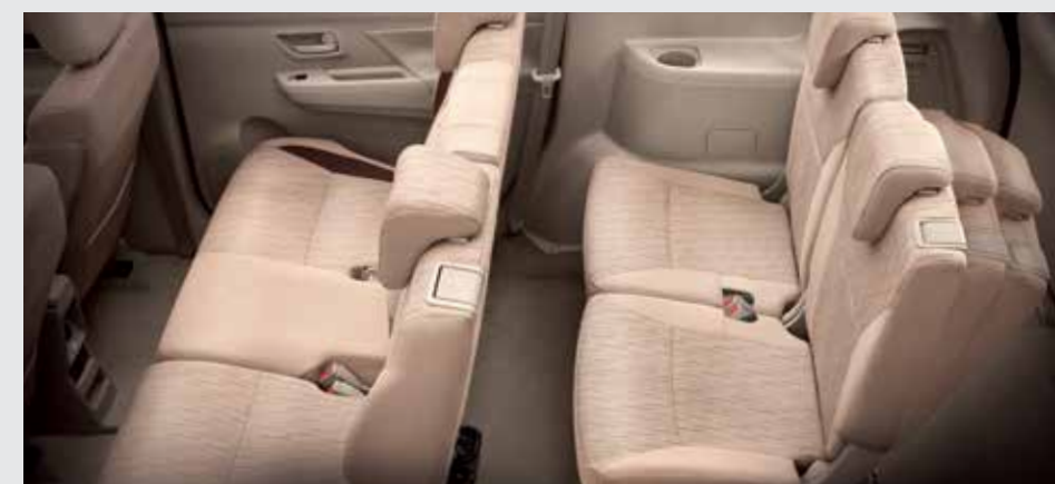
3 rd Row Recliner Seats Ensure comfort for passenger in the 3 rd row.