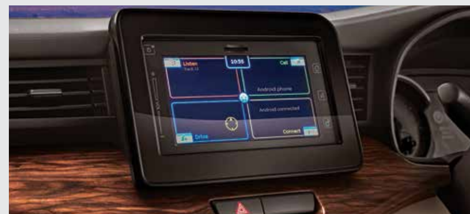
Smartplay Infotainment System Call, talk, search, text, listen, play and do much more.

Advanced technology to help you stay connected with friends and get the best of entertainment even while you drive.