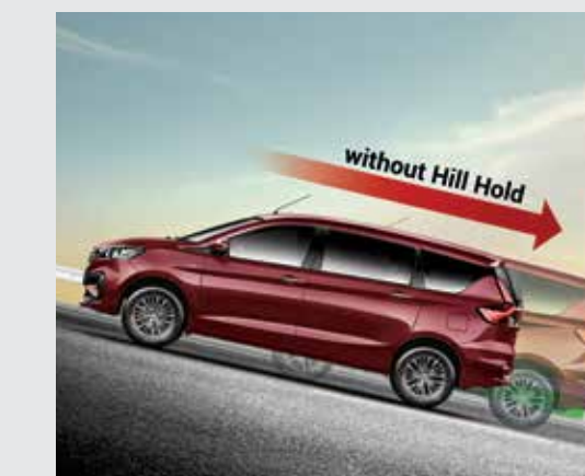
Hill Hold Technology Keeps car stable even on slopes.