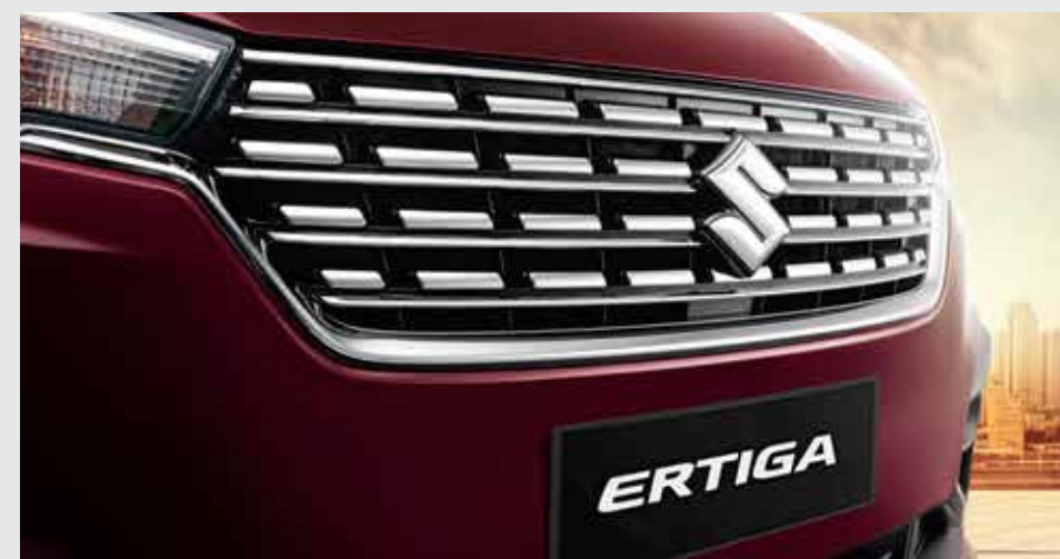
Chrome Studded Front Grille Accentuates the car.

The Ertiga flaunts a bold personality that is carved into every crease, corner and contour of its design.