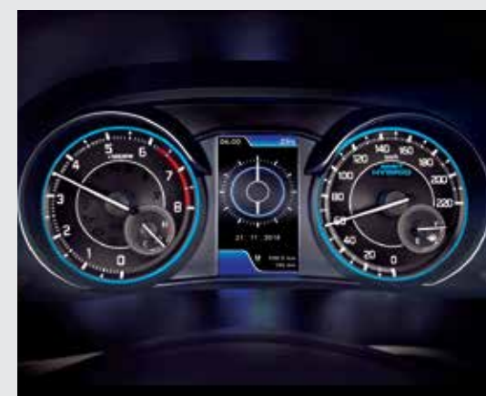
Multi-Information Display with Coloured TFT Gives the vehicle's vital information.