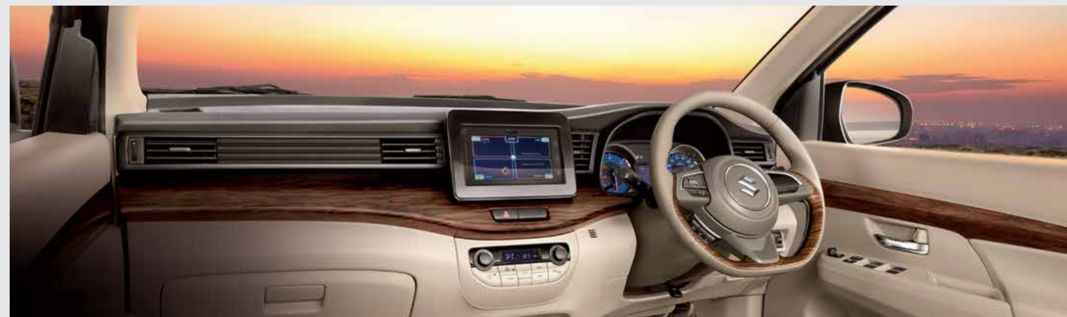
Sculpted Dashboard Maple wood finish for great design.

Space, comfort and quality all come together inside the Ertiga to give you and your friends an experience which is always enjoyable and stylish.