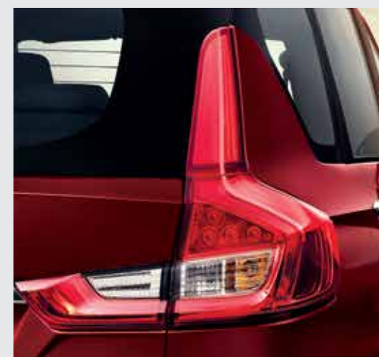
3D Tail Lamps with LED Highlights the stylish exterior.