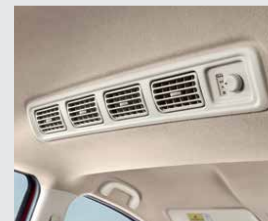
2 nd Row AC Perfect cooling in the back.