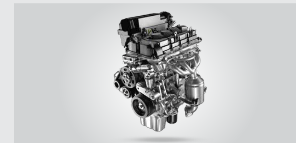
K15 Petrol Engine Ensures a pleasurable driving experience.

Ertiga is engineered to deliver a remarkable performance while ensuring a pleasurable driving experience for all.