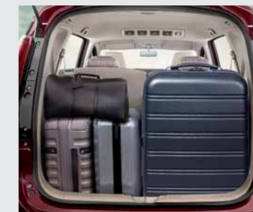
Large Boot Space More room for everything.