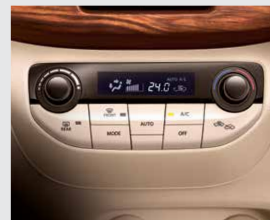
Auto AC Maintains comfort despite outside weather.