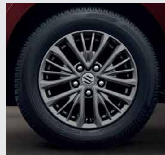
Multi-spoke Alloy Wheels Makes sure you drive in style.