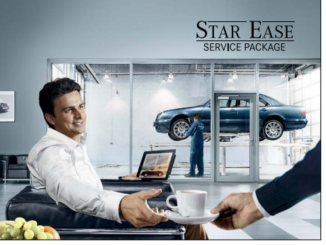
The maintenance of your Star is just as peaceful as driving it