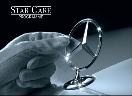
Extended Warranty that guarantees complete peace of mind