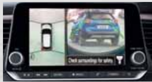
BIRD'S EYE & FRONT VIEW

Consider that you have eyes on all sides. The new Nissan KICKS offers the first-in-class, intelligent Around View Monitor. With four cameras in the Nissan KICKS, you can now get a 360° understanding of your surroundings all on one screen - The 8-inch infotainment screen. Now that's what we call 360° convenience!