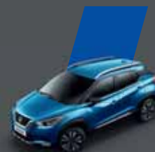
Deep Blue Pearl