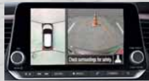
BIRD'S EYE & REAR VIEW