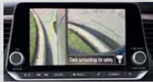
FRONT/REAR & SIDE VIEW