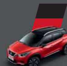
Fire Red & Onyx Black