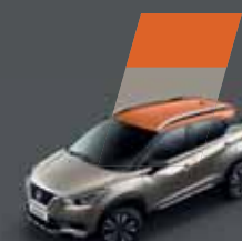
Bronze Grey & Amber Orange