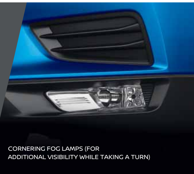
CORNERING FOG LAMPS (FOR ADDITIONAL VISIBILITY WHILE TAKING A TURN)

In the new Nissan KICKS with Auto Headlamps, we ensure the dark never catches you off-guard. Equipped with acute sensors, the KICKS' headlamps come alive in the blink of an eye without even having to flick a switch. Add to that, Cornering Fog Lamps ensure there are no surprises waiting around the corner.