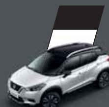
Pearl White & Onyx Black