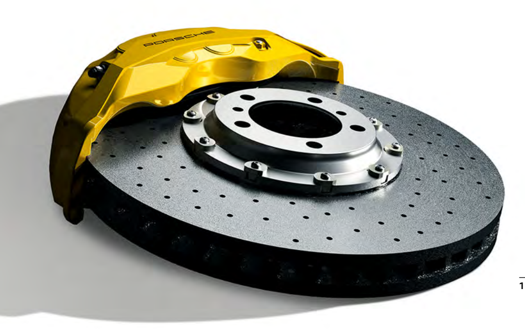
1 Porsche Ceramic Composite Brake (PCCB): brake disc diameter 440mm front and 410mm rear