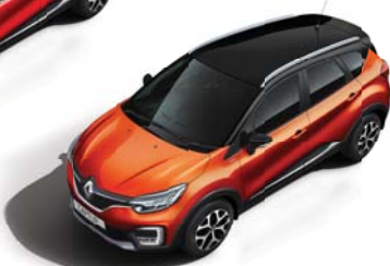
CAYENNE ORANGE BODY WITH MYSTERY BLACK ROOF