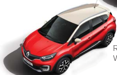
RADIANT RED BODY WITH MARBLE IVORY ROOF