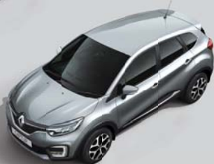
MOONLIGHT SILVER BODY & ROOF