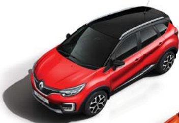
RADIANT RED BODY WITH MYSTERY BLACK ROOF