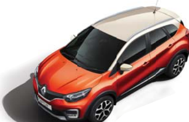
CAYENNE ORANGE BODY WITH MARBLE IVORY ROOF