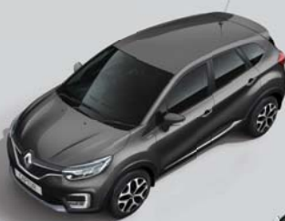
PLANET GREY BODY & ROOF