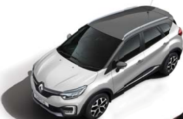
PEARL WHITE BODY WITH PLANET GREY ROOF