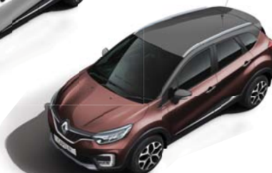
MAHOGANY BROWN BODY WITH PLANET GREY ROOF