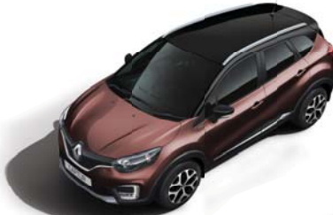
MAHOGANY BROWN BODY WITH MYSTERY BLACK ROOF