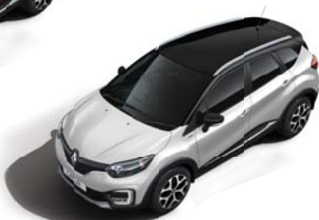
PEARL WHITE BODY WITH MYSTERY BLACK ROOF