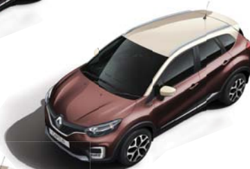
MAHOGANY BROWN BODY WITH MARBLE IVORY ROOF