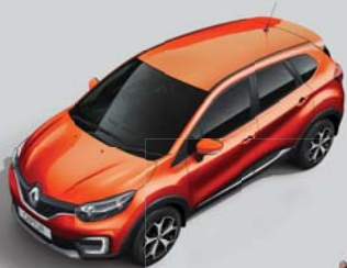
CAYENNE ORANGE BODY & ROOF