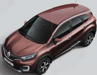
MAHOGANY BROWN BODY & ROOF