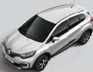
PEARL WHITE BODY & ROOF