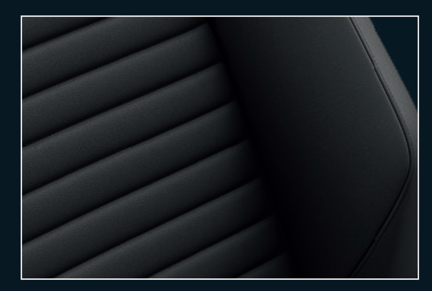
'Nappa' leather upholstery