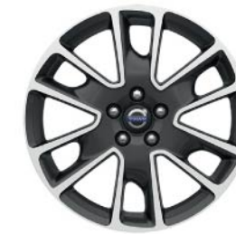
Freja, 8x18" Diamond Cut/Dark Grey