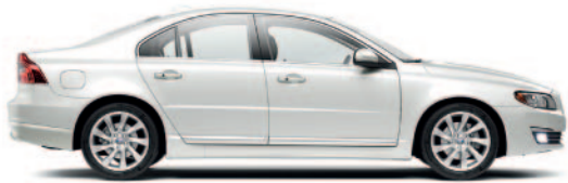
707 Inscription Crystal White Pearl