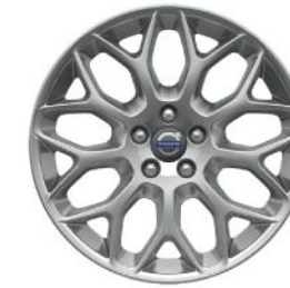
Makara, 8x18" Silver Bright