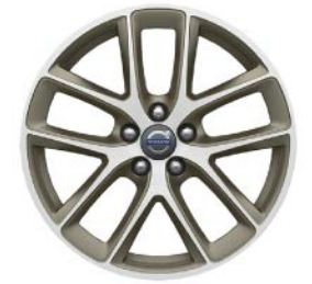
Modin, 8x18" Diamond Cut/Matte Terra Bronze