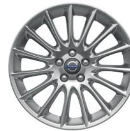
Balius, 8x18" Silver Bright