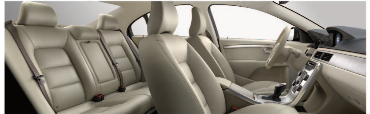
Leather, 211B Soft Beige in Sandstone Beige interior with Soft Beige headlining