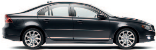
492 Savile Grey Metallic