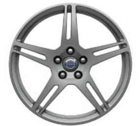
Ymir, 8x18" Light Light Grey