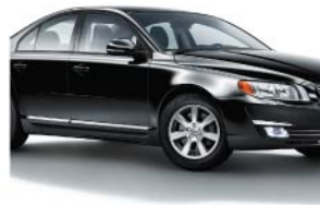
Exterior Chrome Kit