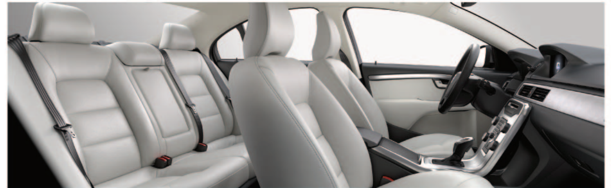
Leather, 210G Blond in Anthracite Black interior with Quartz headlining