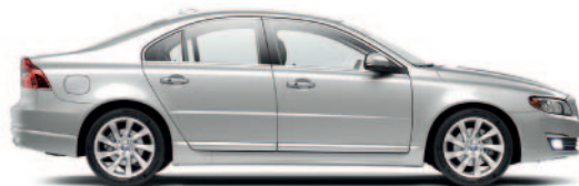
711 Bright Silver Metallic