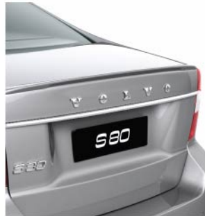
Spoiler, Boot lid