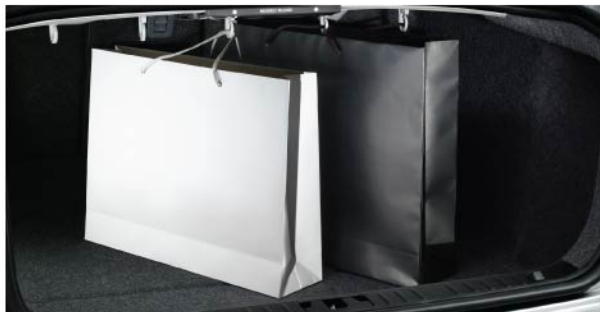
Luggage Compartment Mat - Textile, Reversible