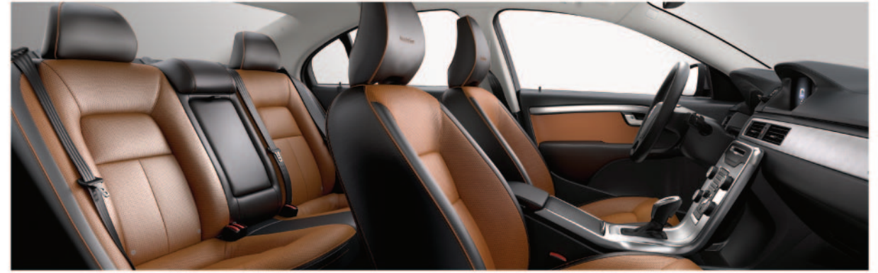
Inscription Soft Leather, 2G0J Toscana Tan in Anthracite Black interior