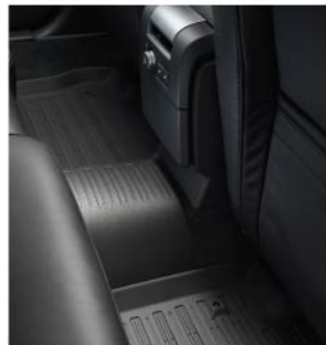
Passenger Floor Mat - Rubber