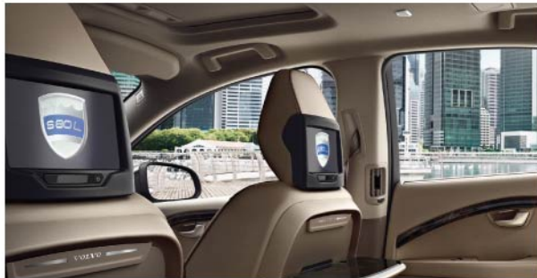
Rear Seat Entertainment