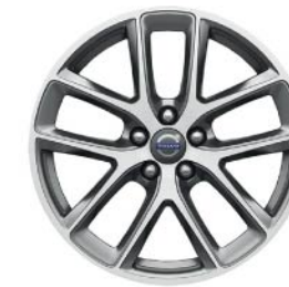
Modin, 8 x 18" Diamond Cut/Matte Iron Stone