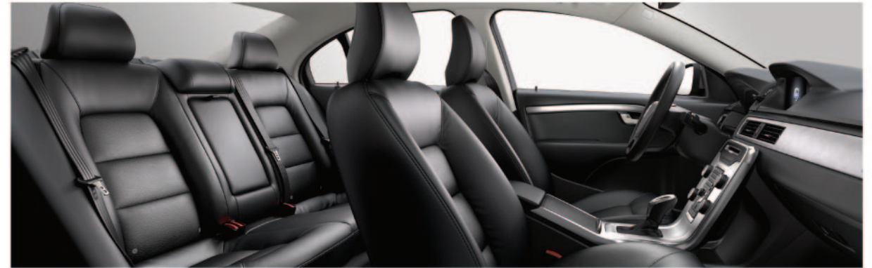
Leather, 2101 Offblack in Anthracite Black interior with Quartz headlining