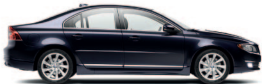
467 Magic Blue Metallic