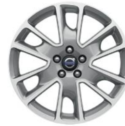
Freja, 8x18" Diamond Cut/Light Grey