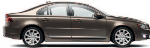
700 Twilight Bronze Metallic