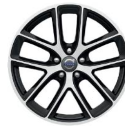
Modin, 8x18" Diamond Cut/Glossy Black