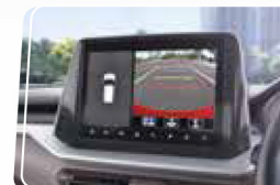
360 View Camera