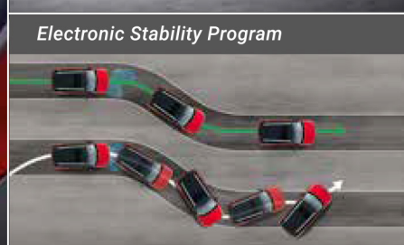
Electronic Stability Program