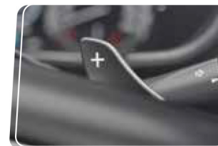
6-Speed AT with Paddle Shifters