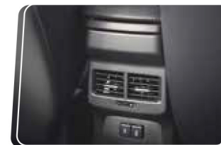
Rear AC Vents with Fast Charging USB Ports