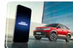
Next Gen Suzuki Connect