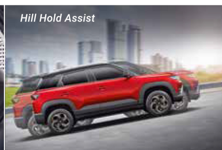
Hill Hold Assist

The Hot and Techy Brezza comes with a bundle of safety features that help keep the fun in your urban adventures intact. It is equipped with 20+ safety features including 6 airbags and ESP with Hill Hold Assist, ensuring that your safety is our priority.