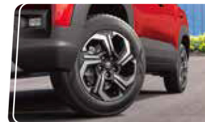
Bold Geometric Alloy Wheels

The Hot and Techy Brezza introduces a youthful and energetic design, ensuring you are ready for an adventurous drive in the city every day. Its commanding stance, impressive looks and precision detailing ensure that it never goes unnoticed. The City-Bred SUV comes with a clean Beltline with Bold Geometric Alloy Wheels, Dual Tone exteriors with a Shark Fin Antenna that enhances its design.