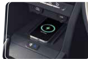
Wireless Charging Dock

The Hot and Techy Brezza carries a youthful and exciting appeal on the inside with your convenience at its core. It gets a unique design, modern and sleek look and black and brown interiors with silver accents for a sporty and urban feel. The City-Bred SUV also has Rear AC Vents, a Fast Charging USB Port (Type A and C) and a flat bottom Steering Wheel for your enhanced comfort and convenience. The 6-Speed Automatic Transmission with Paddle Shifters and Telescopic Steering ensure you go on city adventures comfortably.