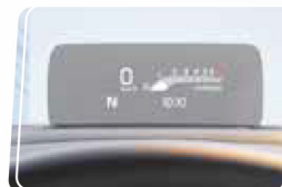
Head Up Display