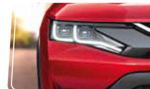
Dual LED Projector Headlamps with LED DRLs