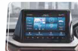
SmartPlay Pro+ with Surround Sense powered by ARKAMYS