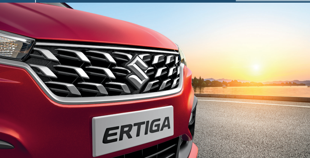
Dynamic Chrome Winged Front Grille The most stylish way to make an entrance.

● Elegant from every angle, the Ertiga is designed to bring out the stylish side of togetherness.