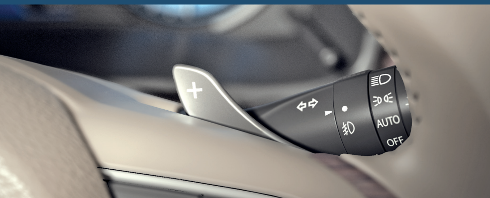
6-Speed AT with Paddle Shifters Surge ahead by engaging the smart paddle shifters.

● Togetherness, driven by technology. The Ertiga is equipped with state-of-the-art technology to add more fun to your moments of togetherness.