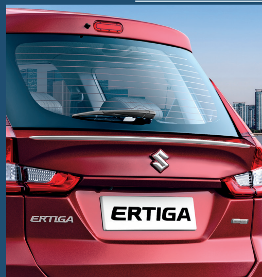
New Back Door Garnish with Chrome Insert Let those second looks chase you.