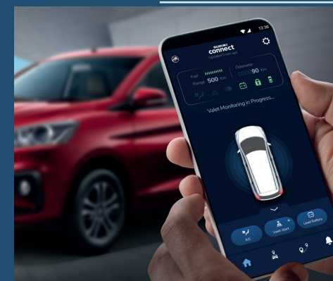
Connected Car Technology with Suzuki Connect Always stay connected with your car.