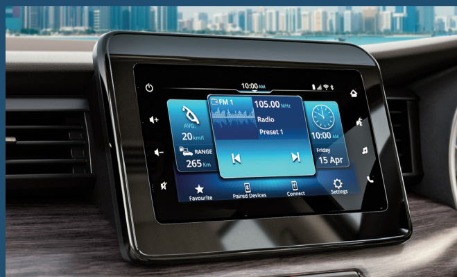
17.78cm Smartplay Pro Connect with your world with just a voice command - "Hi Suzuki".