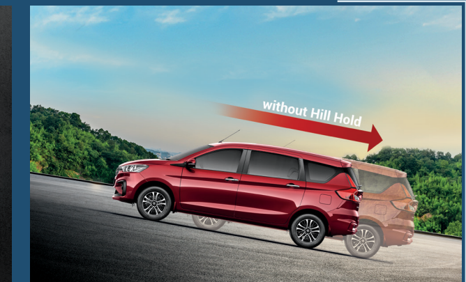
Hill Hold Technology Prevents the car from rolling back momentarily.