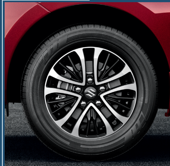
Machined Two-Tone Alloy Wheels Make a statement, every time.