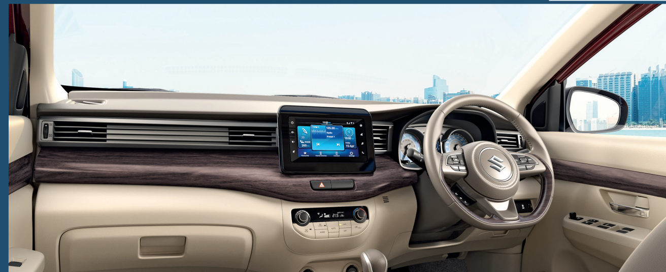
Sculpted Dashboard with Metallic Teak-Wooden Finish Get welcomed by elegance every time you step in.