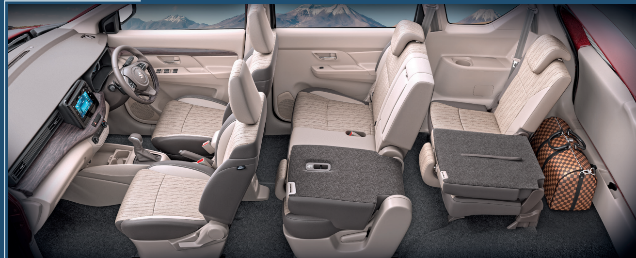
Smart Flexi Seating with 2 nd & 3 rd Row Recliner Seats Spacious and smart with 2 nd row one-touch recline & slide for easy 3 rd row access.