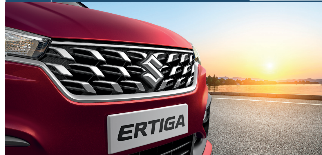
Dynamic Chrome Winged Front Grille The most stylish way to make an entrance.