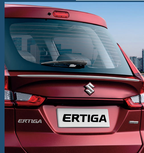
New Back Door Garnish with Chrome Insert Let those second looks chase you.