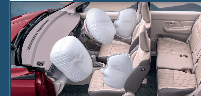
Quad Airbags Enhanced safety for everyone.