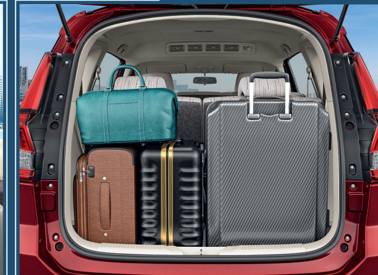
Large & Flexible Boot Space A lot can go in before you do.