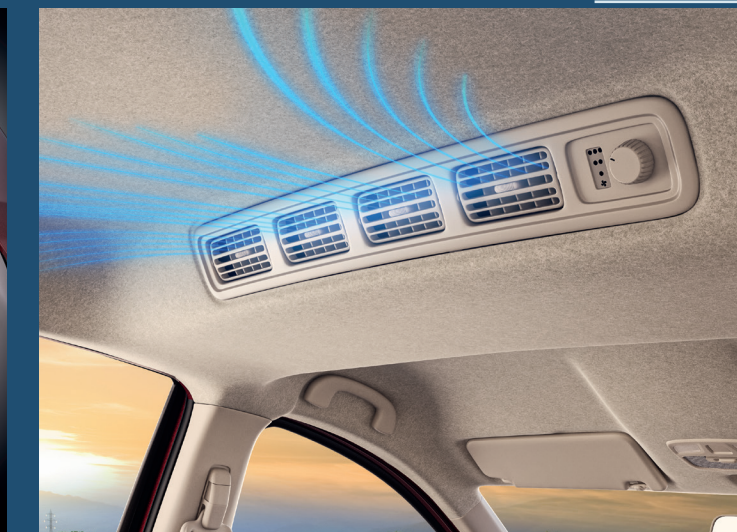
2 nd Row Roof-Mounted AC A cool experience for all with 3-Stage Speed Control.