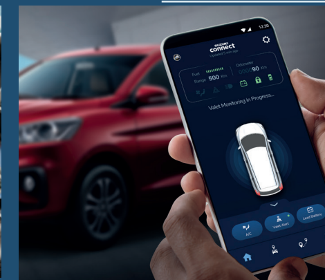
Connected Car Technology with Suzuki Connect Always stay connected with your car.