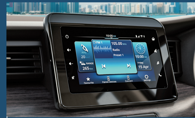
17.78cm SmartPlay Pro Connect with your world with just a voice command - "Hi Suzuki".