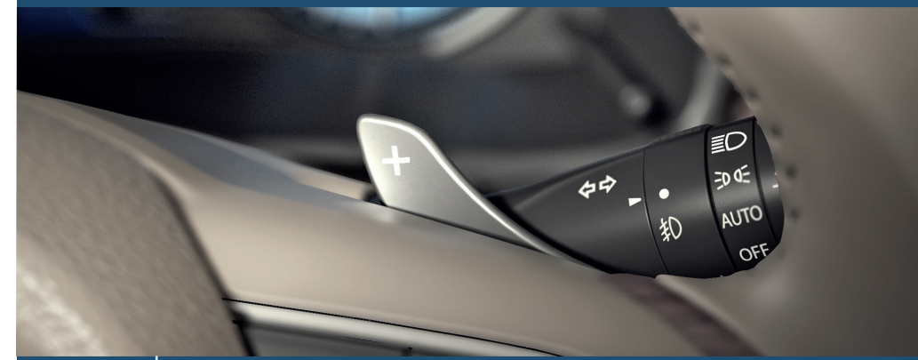
6-Speed AT with Paddle Shifters Surge ahead by engaging the smart paddle shifters.