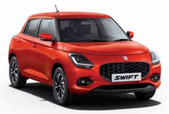
/ Novel Orange