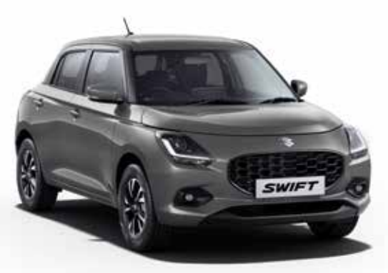
/ Magma Grey