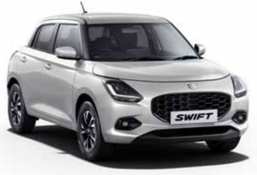
Pearl Arctic White