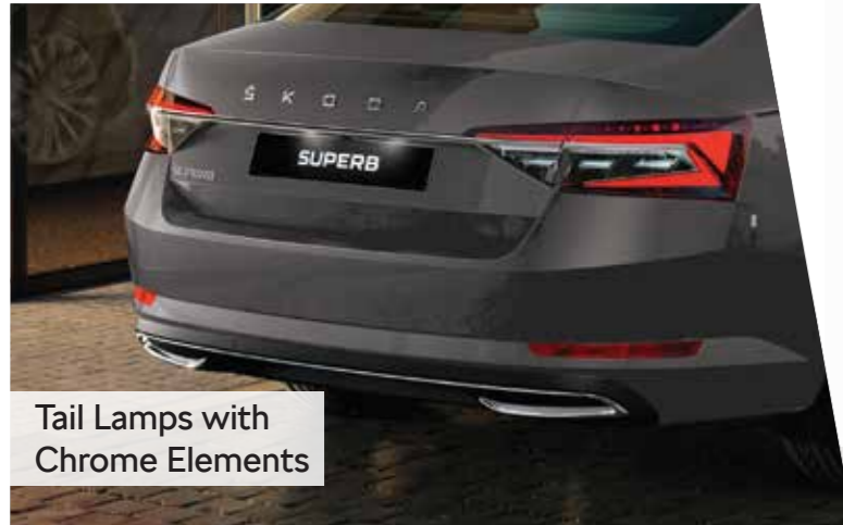
Tail Lamps with Chrome Elements