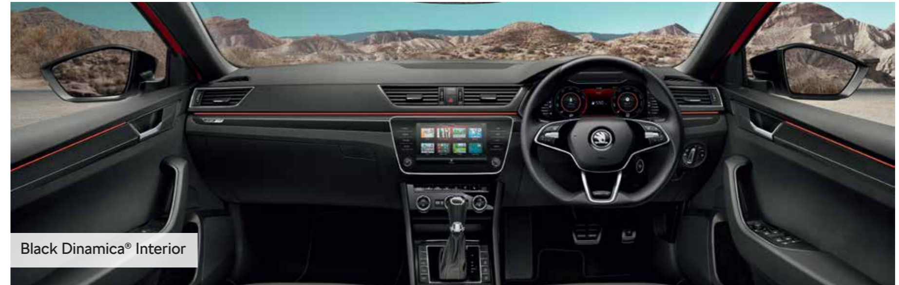
Black Dinamica® Interior