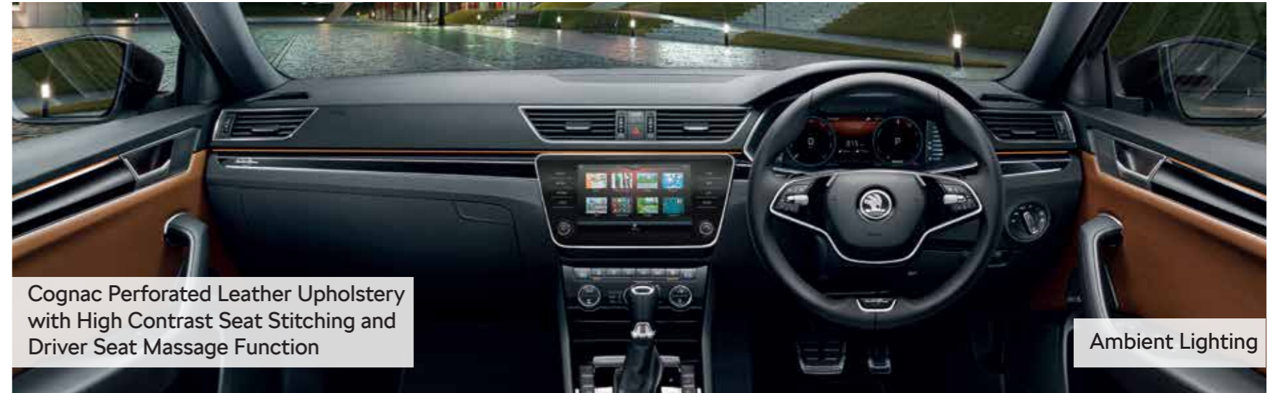
Cognac Perforated Leather Upholstery with High Contrast Seat Stitching and Driver Seat Massage Function