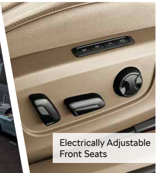
Electrically Adjustable Front Seats