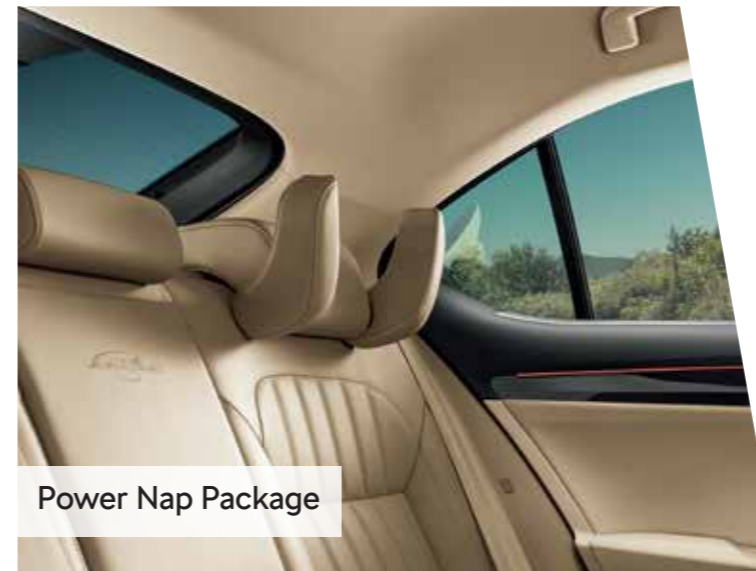
Power Nap Package