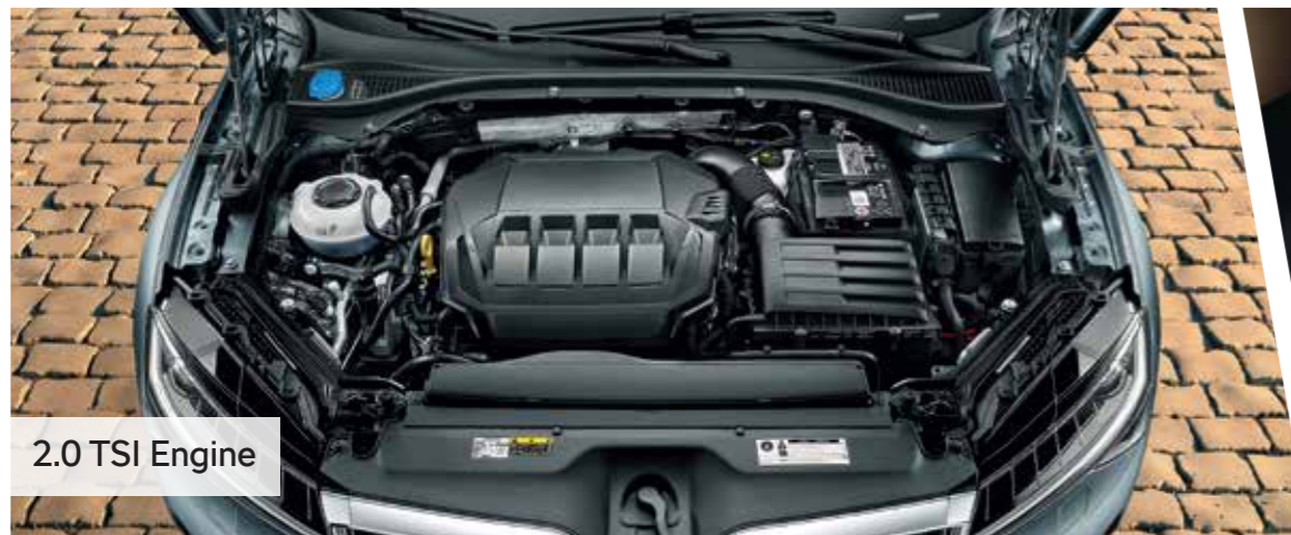
2.0 TSI Engine