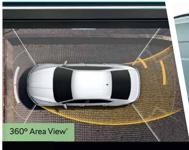
360° Area View*