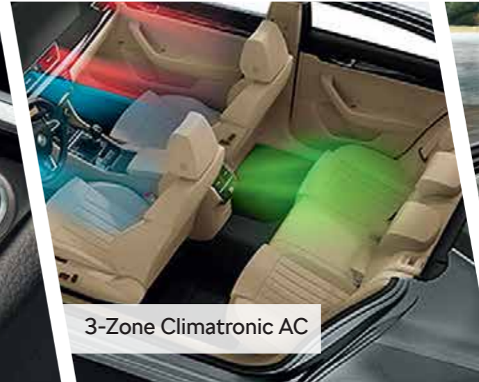
3-Zone Climatronic AC