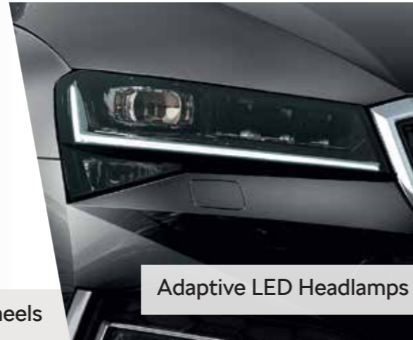
Adaptive LED Headlamps