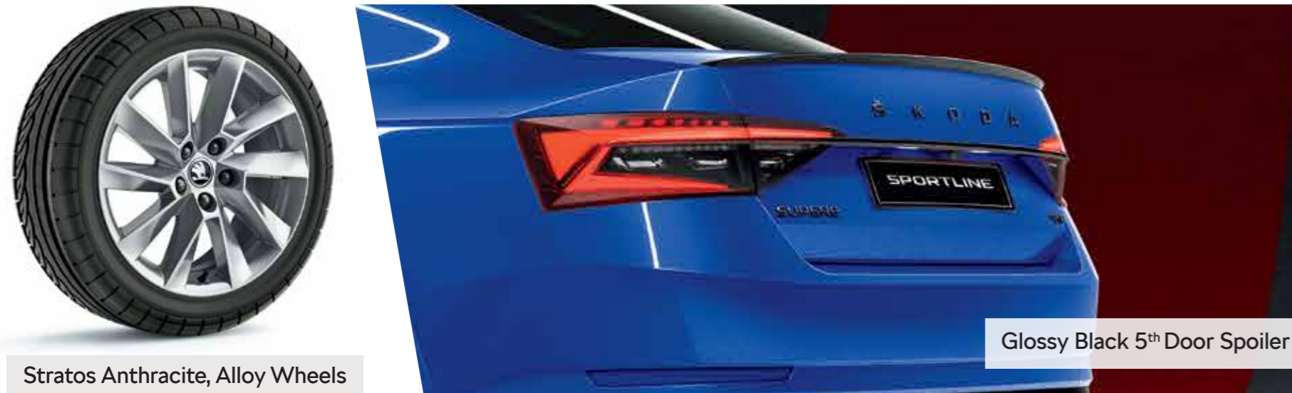
Glossy Black 5 th Door Spoiler