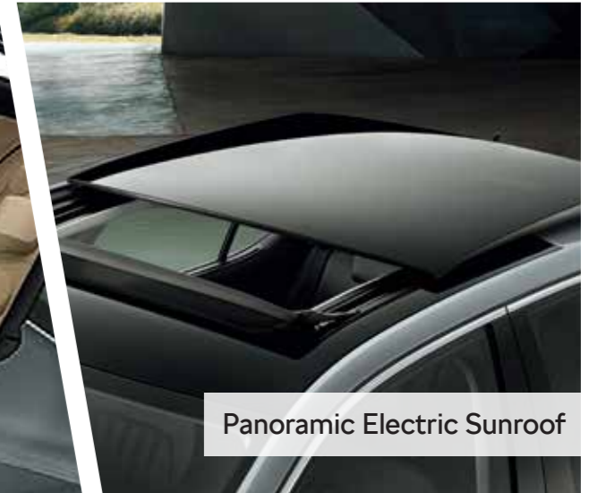
Panoramic Electric Sunroof