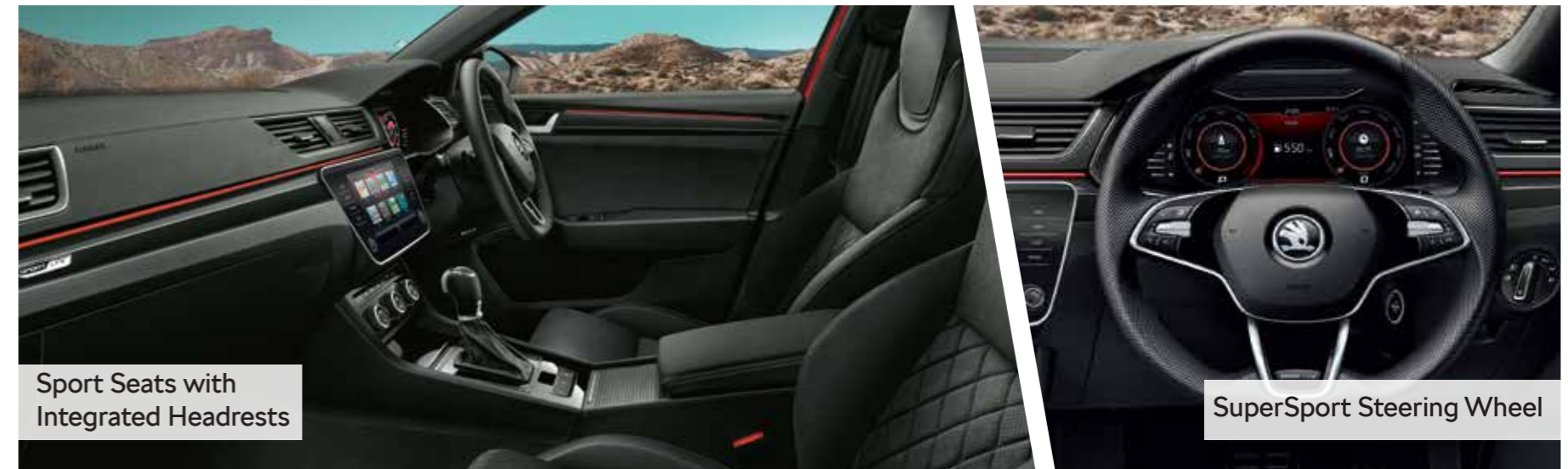
Sport Seats with Integrated Headrests