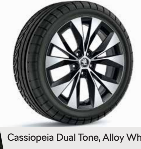
Cassiopeia Dual Tone, Alloy Wheels