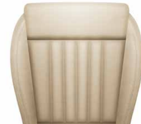
Stone Beige Perforated Leather