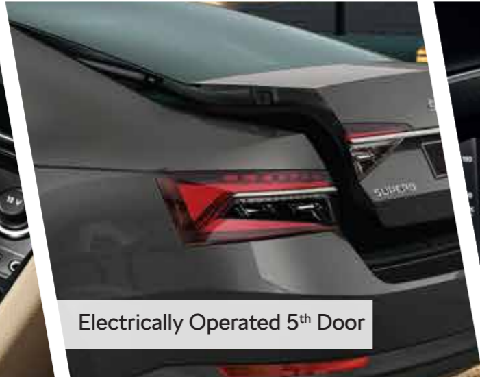
Electrically Operated 5 th Door