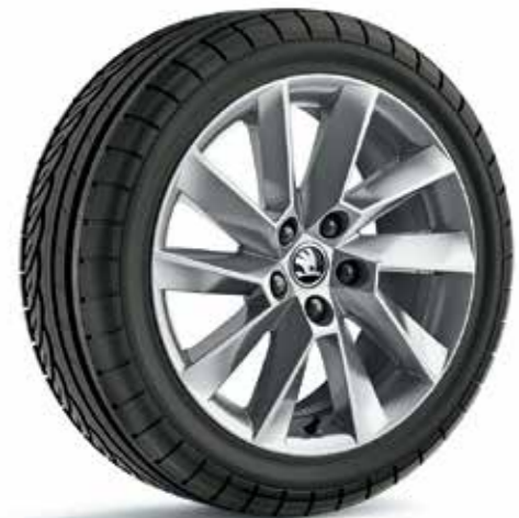
Stratos Anthracite, Alloy Wheels