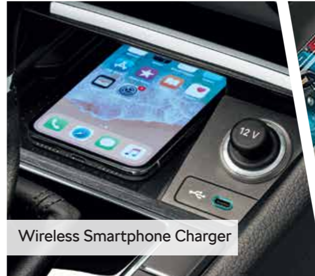
Wireless Smartphone Charger