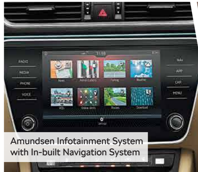
Amundsen Infotainment System with In-built Navigation System