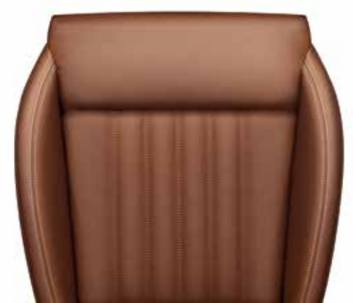
Cognac Perforated Leather