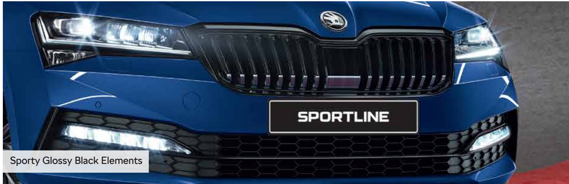
Sporty Glossy Black Elements