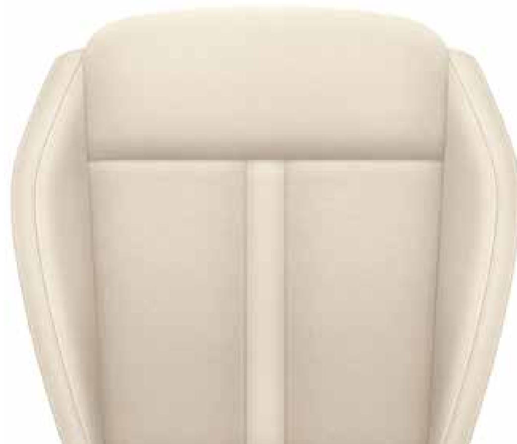
BEIGE SUEDIA LEATHER