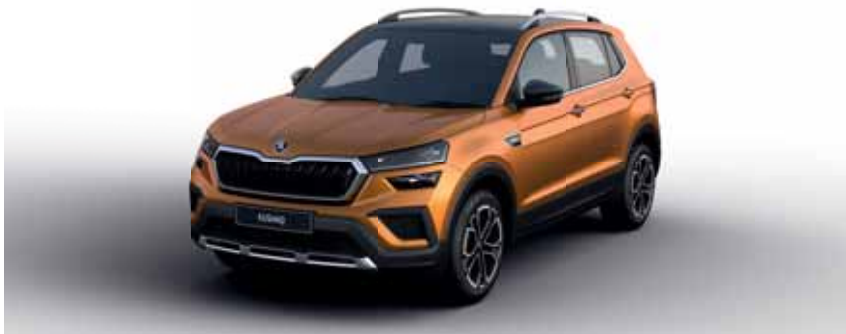
HONEY ORANGE WITH CARBON STEEL ROOF