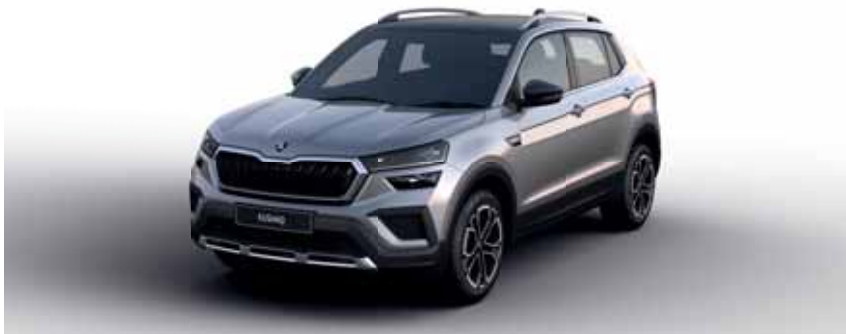
BRILLIANT SILVER WITH CARBON STEEL ROOF