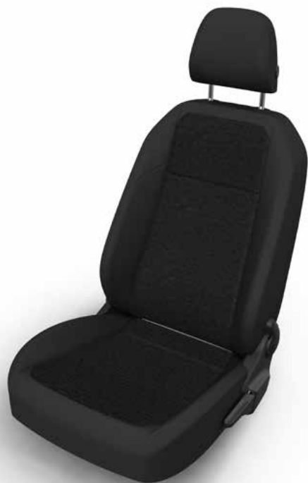
ACTIVE Black fabric woven seats.