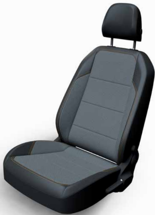
STYLE Black front leather/rear leatherette seats with perforated grey designs.