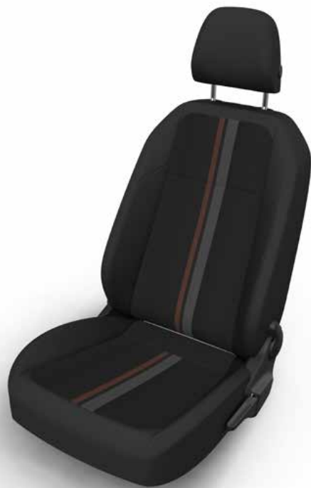
AMBITION Black fabric seats with dual colour sporty centre stripes.