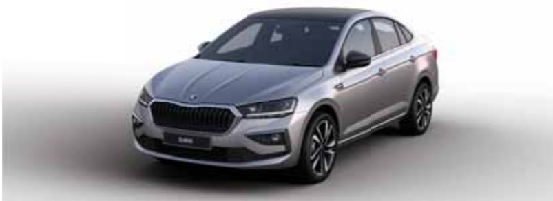
BRILLIANT SILVER WITH CARBON STEEL ROOF