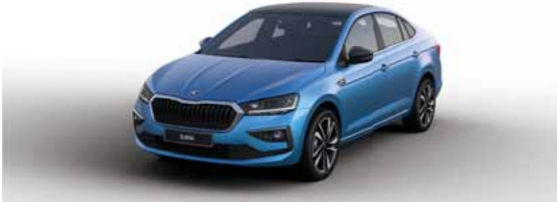
CRYSTAL BLUE WITH CARBON STEEL ROOF