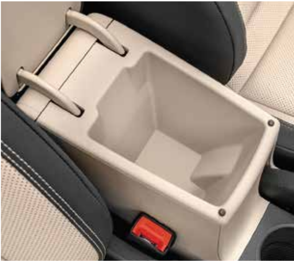
Storage In Front Centre Armrest