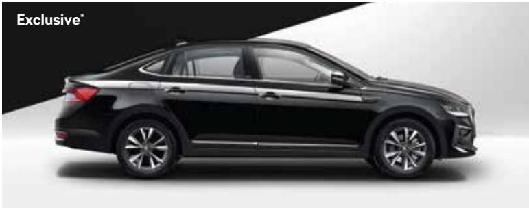
Elegance Edition - Deep Black