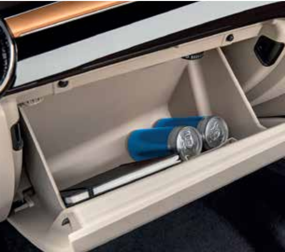
Cooled Glove Box