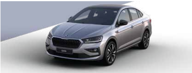
Brilliant Silver With Carbon Steel Roof