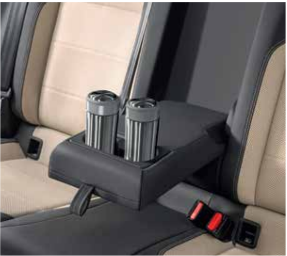
Cupholders In The Armrest