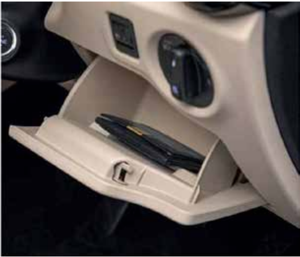
Driver Storage Compartment

Never compromise on boot space. Škoda Slavia sets the standard with best-in-segment storage – 521 liters with rear seats up, and a whopping 1050 liters when folded down.