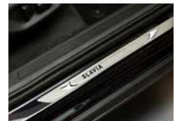
Scuff Plate with 'Slavia' Inscription