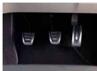
Textile Mat & Aluminium Pedal