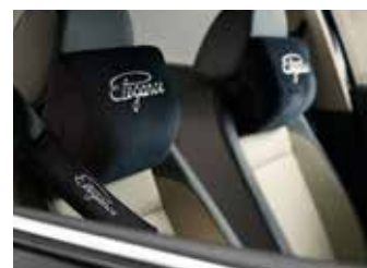
'Elegance' Seat-Belt Cushions & Neck Rests