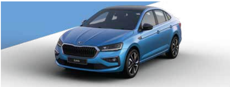
Crystal Blue With Carbon Steel Roof