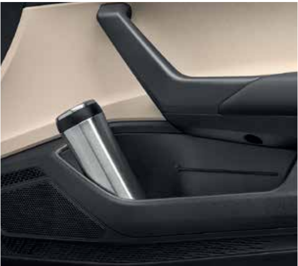
Storage In Front And Rear Doors