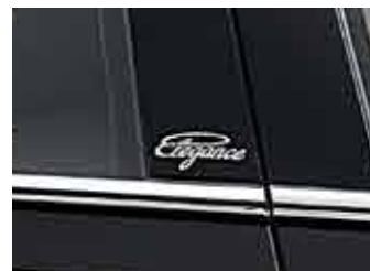
'Elegance' Badge on B-Pillar