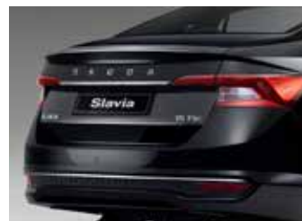
Chrome Side & Trunk Garnish