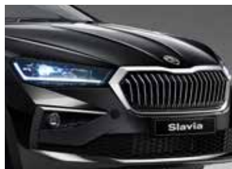
Radiator Chrome Grill