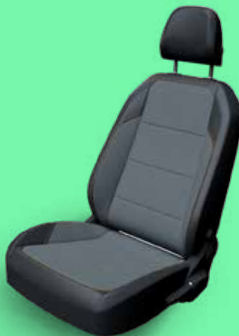
Style Black front leather/rear leatherette seats with perforated grey designs.