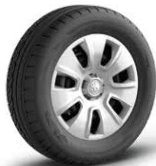
Active Steel Wheels R(16), Lhotse