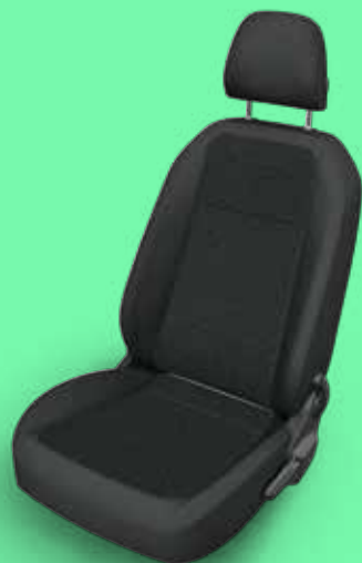
Active Black fabric woven seats.