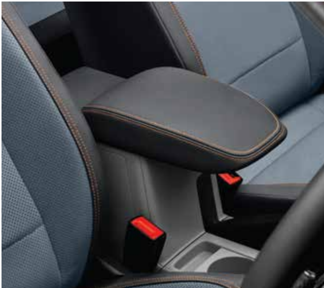
Storage In Front Centre Armrest