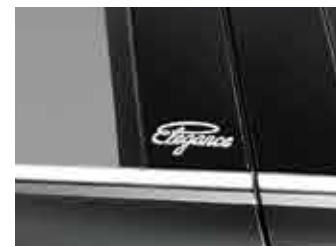
'Elegance' Badge on B-Pillar