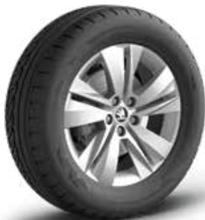
Ambition Alloy Wheels R(16), Grus