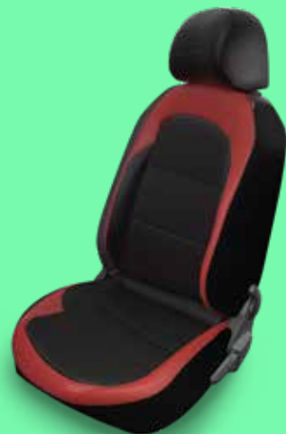
Monte Carlo Inscribed Ventilated Red & Black Front Leather Seats