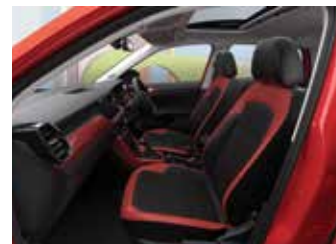
Monte Carlo Inscribed Ventilated Red & Black Front Leather Seats