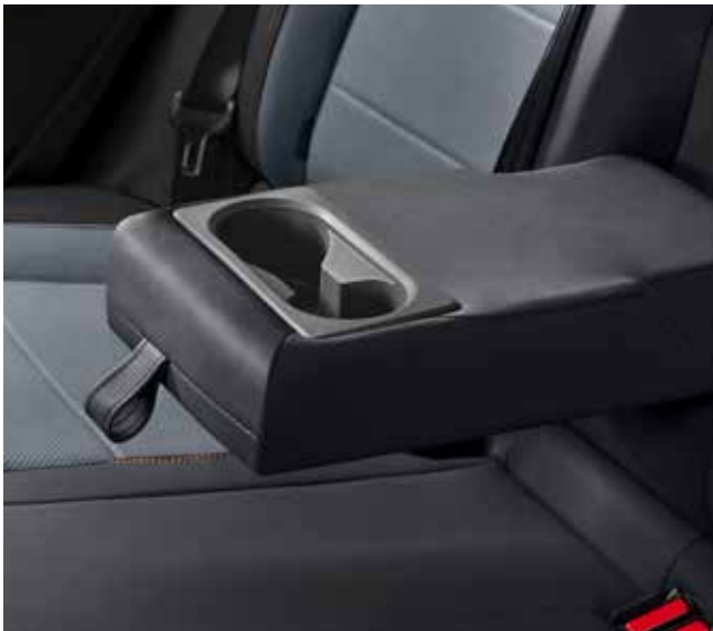
Cupholders In Armrest