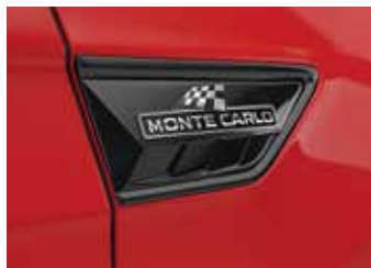
Monte Carlo Fender Garnish