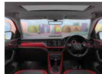
Red Ambient Lighting with Ruby Red Metallic Décor