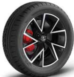
Monte Carlo R17 Dual-tone Vega Alloy Wheels With Red Brake Calipers