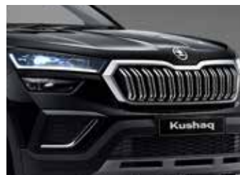
Radiator Chrome Grill