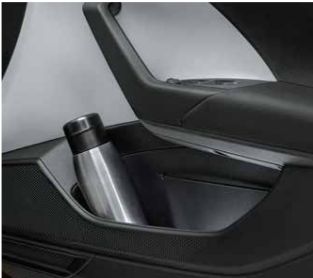
Storage In the Front and Rear Doors