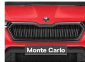
Škoda Signature Grille With Glossy Black Surround