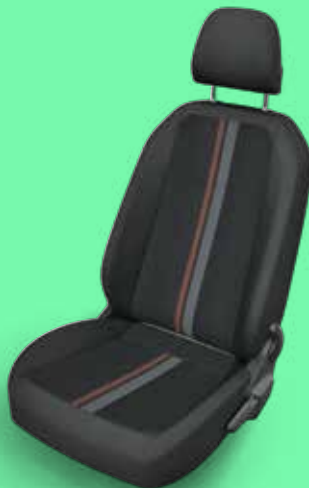
Ambition Black fabric seats with dual colour sporty centre stripes.