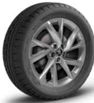
Style Alloy Wheels R(17), Vega Silver