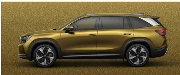
Bronx Gold metallic*