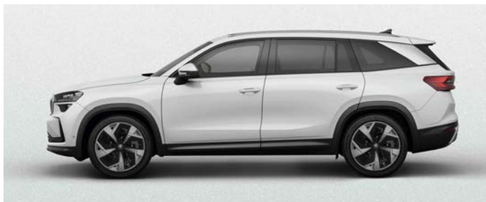
Moon White metallic