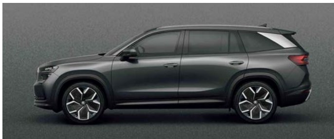
Graphite Grey metallic