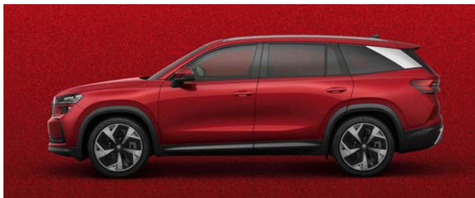
Velvet Red metallic