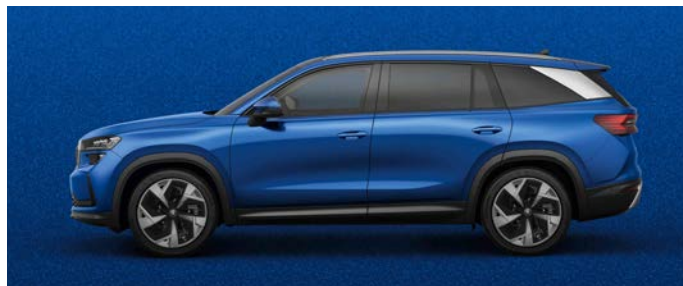
Race Blue metallic