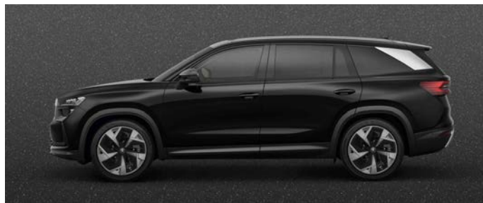
Magic Black metallic