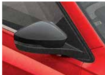
Black Mirror Cover