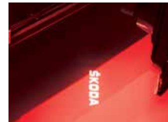
Puddle Lamp with Škoda Logo Projection