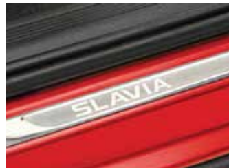
Slavia Scuff Plate