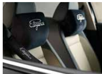
'Elegance' Seat-Belt Cushions & Neck Rests