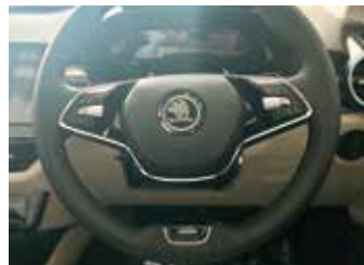
Steering Wheel Edition Badge