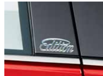
Exclusive B-Pillar Edition Badging