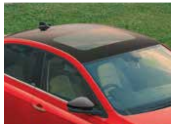
Black Roof Foil with Electric Sunroof