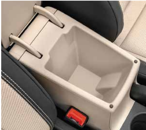
Storage In Front Centre Armrest