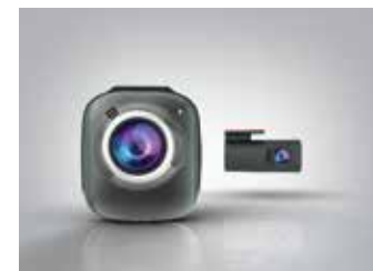
Latest Dual Dash Cam