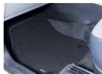
Premium Textile Mats