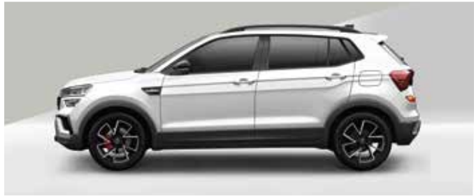
Monte Carlo - Candy White with Carbon Steel Painted Roof