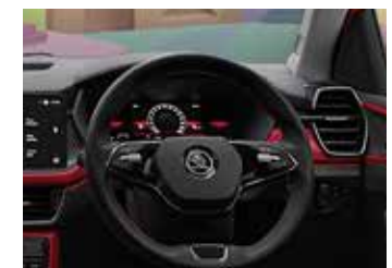
20.32cm Škoda Virtual Cockpit with Red Theme