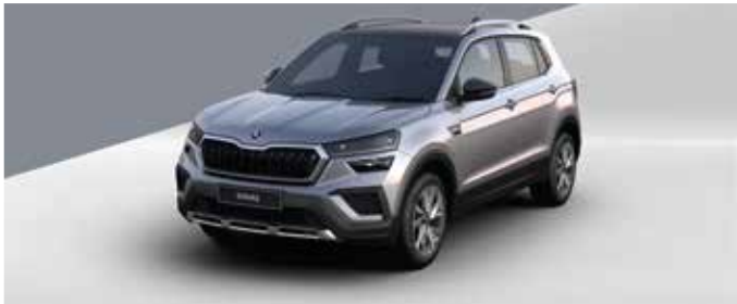
Brilliant Silver With Carbon Steel Roof