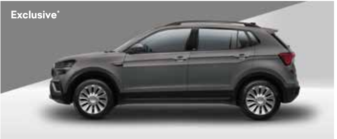
Kushaq Onyx - Carbon Steel