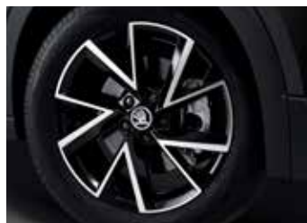
Vega Dual Tone Alloys