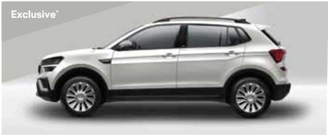
Kushaq Onyx - Candy White