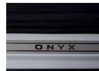
Onyx Inscribed Front Scuff Plates