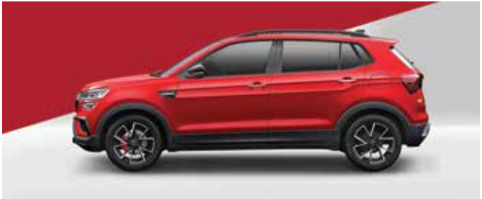
Monte Carlo - Tornado Red with Carbon Steel Painted Roof