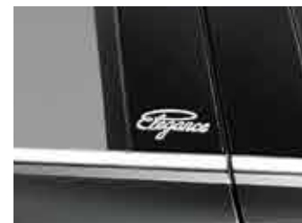
'Elegance' Badge on B-Pillar