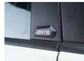
Onyx Badge on B-Pillar