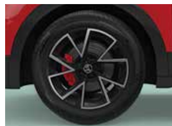
R17 Dual-tone Vega Alloy Wheels With Red Brake Calipers*