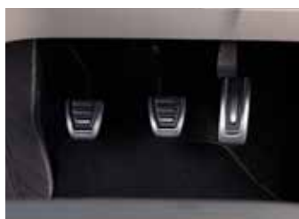
Textile Mat & Aluminium Pedal