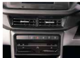
Climatronic Auto A/C