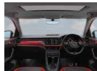
Red Ambient Lighting with Ruby Red Metallic Décor