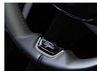
Steering Wheel 'Elegance' Badge