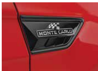
Monte Carlo Fender Garnish