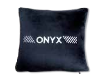
Memory-foam Cushion Pillows with Onyx Inscription