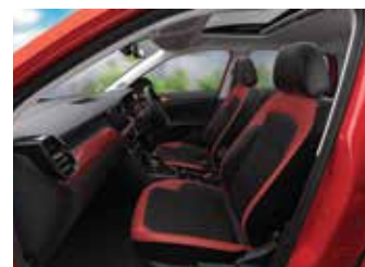
Monte Carlo Inscribed Ventilated Red & Black Front Leatherette Seats