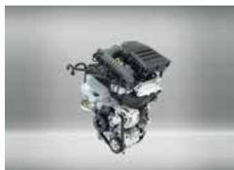
1.0 TSI Engine