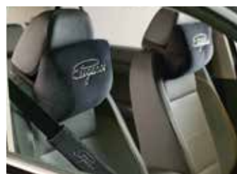
'Elegance' Seat-Belt Cushions & Neck Rests