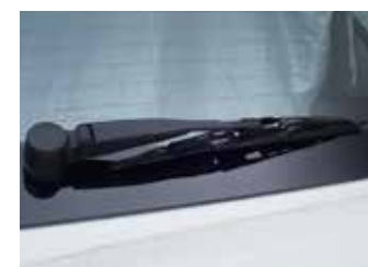
Rear Wiper & De-fogger