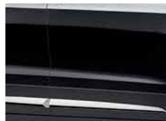
Body Side Molding Chrome