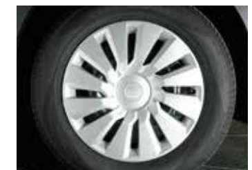
Steel Wheels R(16) + Wheel Cover, Tecton