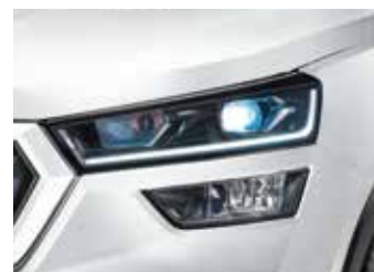
LED Head Lamp & Front Fog Lamp