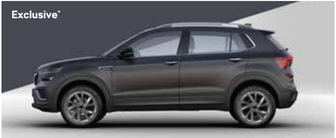
Kushaq Matte Edition