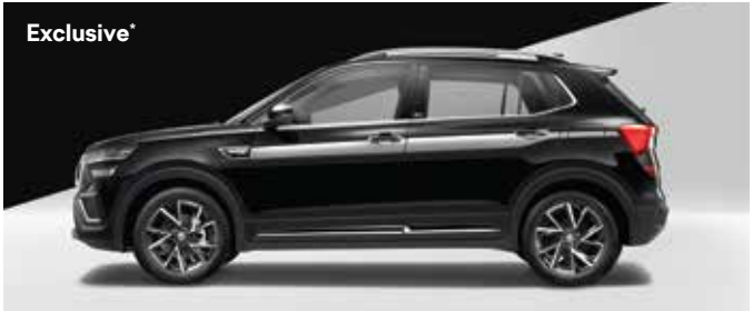
Elegance Edition - Deep Black