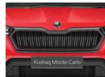
Škoda Signature Grille With Glossy Black Surround