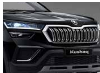
Radiator Chrome Grill