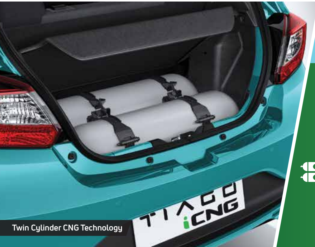
Twin Cylinder CNG Technology

For effortless shifting between CNG and petrol mode while maintaining higher fuel efficiency.