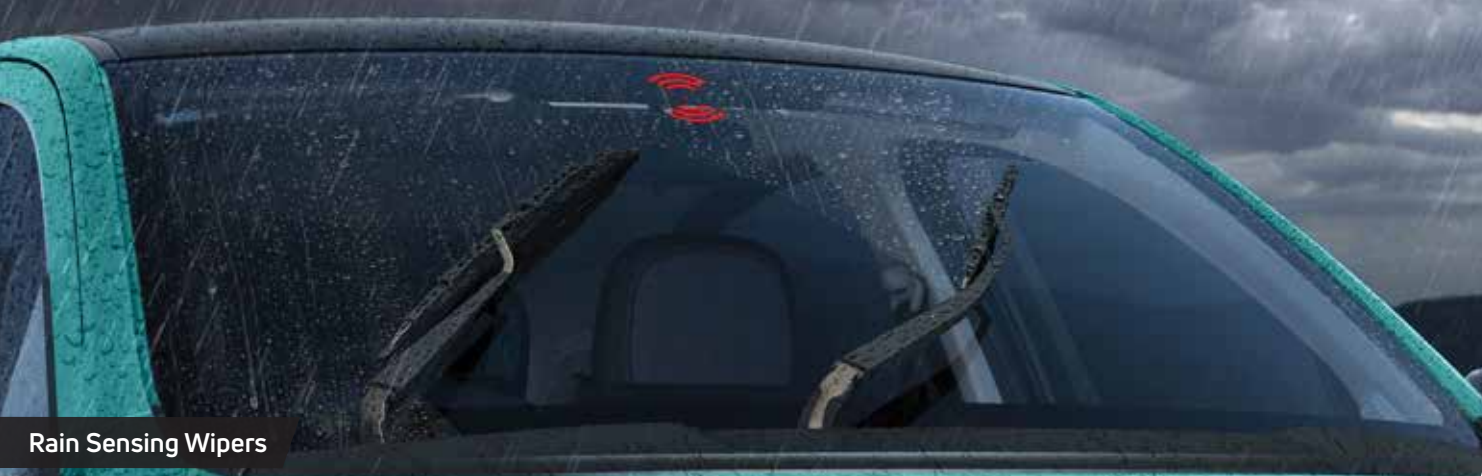
Rain Sensing Wipers