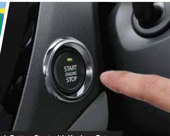
Push Button Start with Keyless Entry