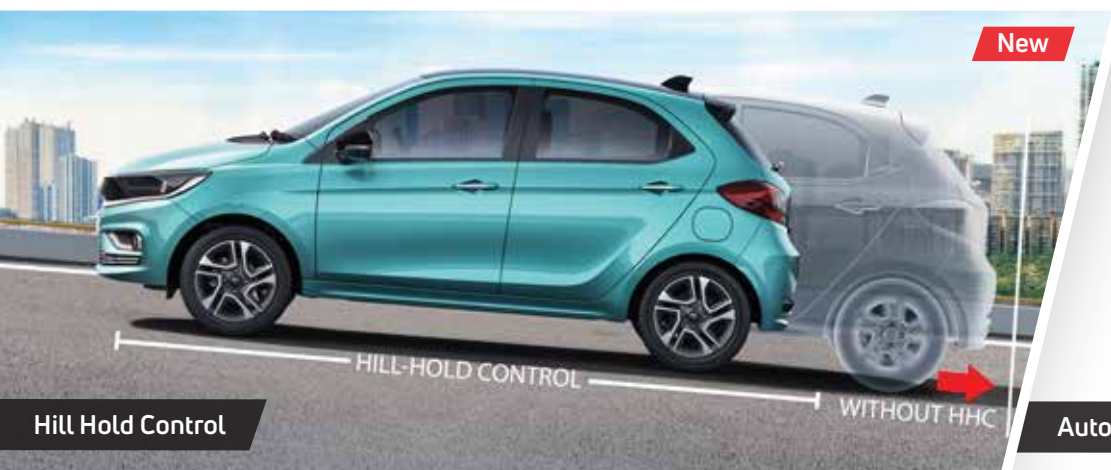
Hill Hold Control