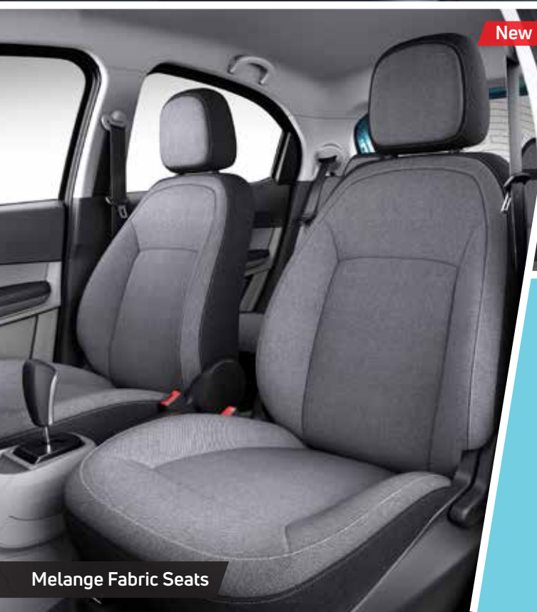
Melange Fabric Seats