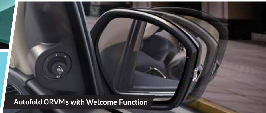
Autofold ORVMs with Welcome Function