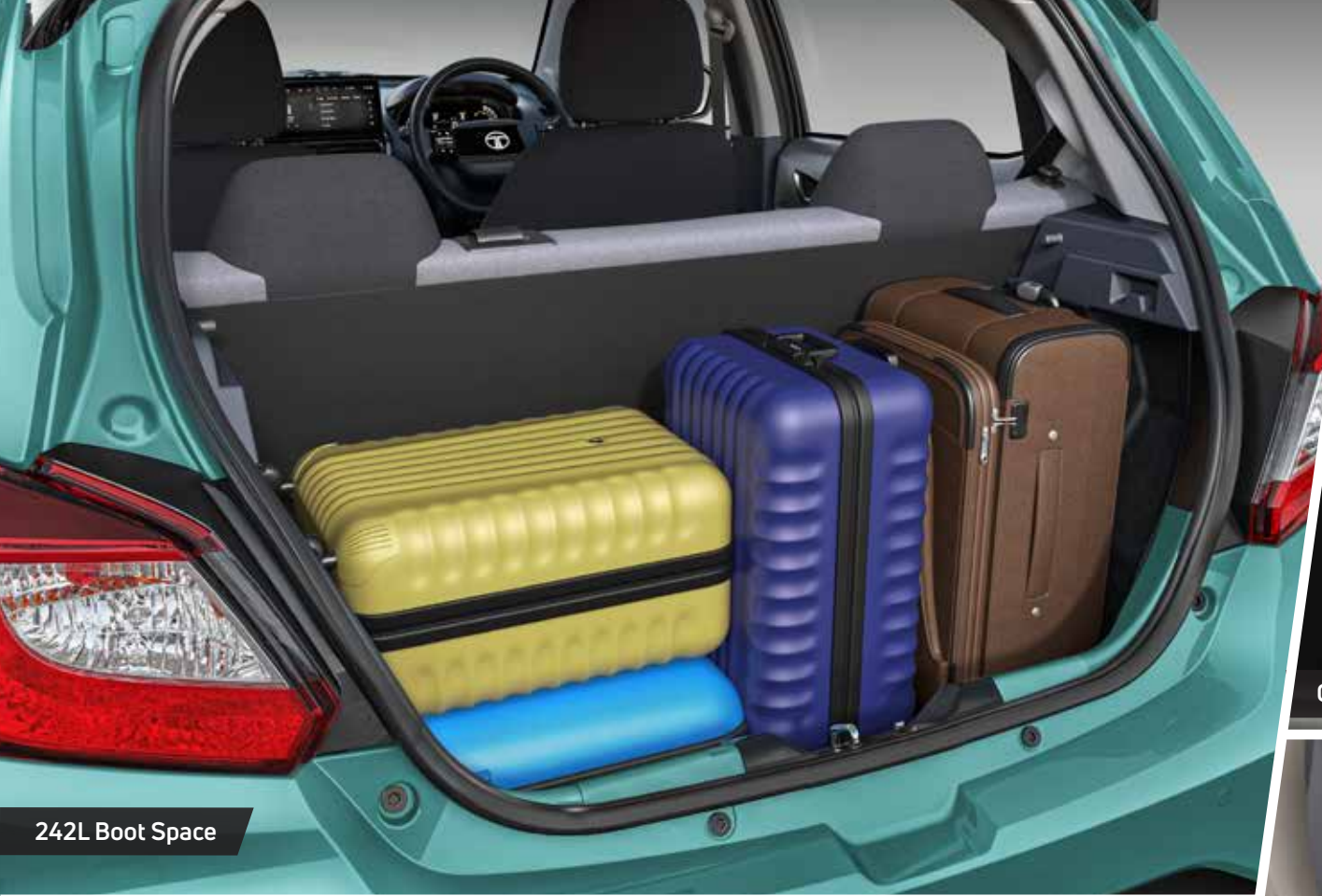
242L Boot Space