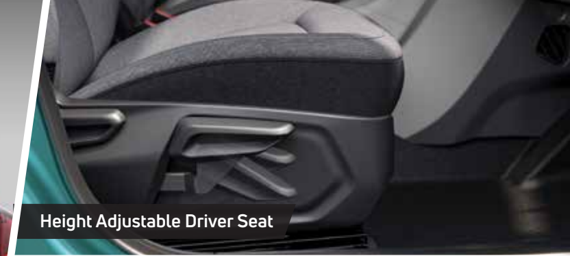
Height Adjustable Driver Seat