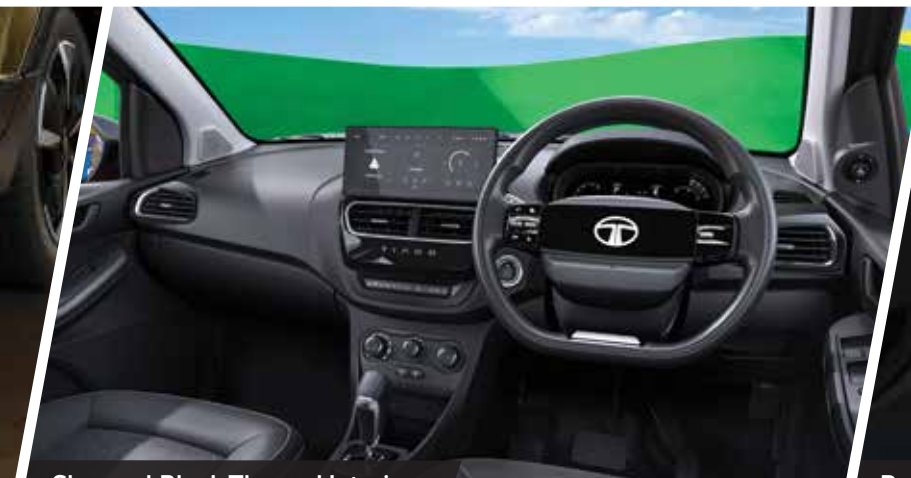
Charcoal Black Themed Interiors