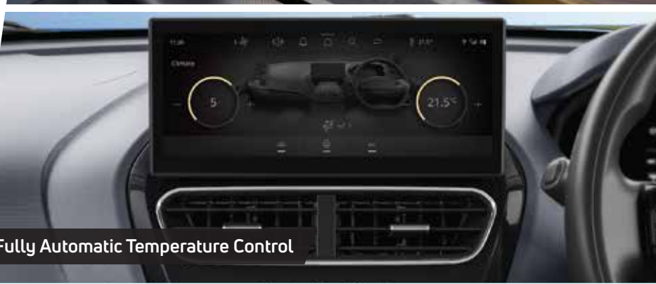
Fully Automatic Temperature Control