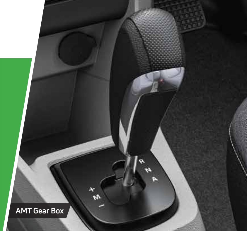
AMT Gear Box

#1* Refers To Introduced By Tata Motors Passenger Vehicles And Industry Represent The Passenger Car Segment.