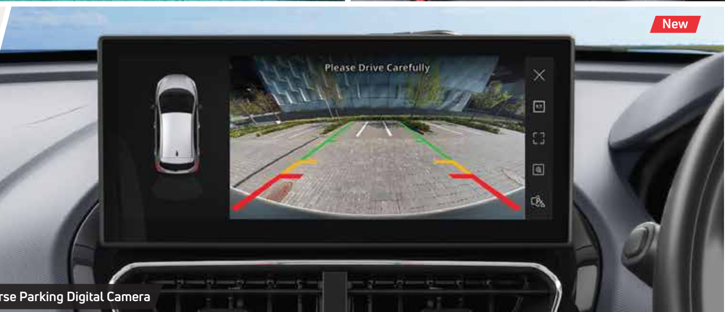
HD Reverse Parking Digital Camera