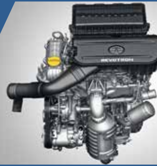
Max Power-86 ps @ 6000 r/min

Who says a peppy drive can't be thrilling? The Advanced AMT Transmission of Tiago lets you zip through any road without shifting a gear. The 1.2 L Revotron BS6 petrol engine with the power of 86 ps @ 6000 r/min gives you an all-round performance.