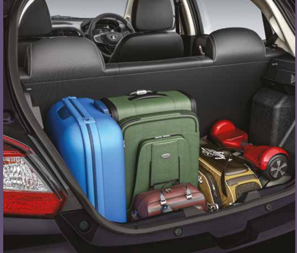
242 l Boot Space