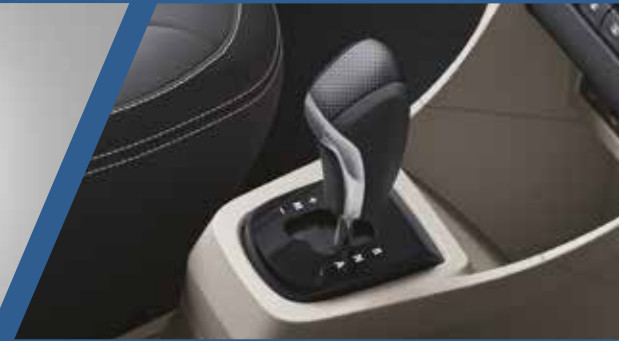
Advance AMT Transmission