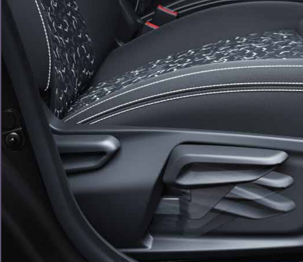
Height Adjustable Driver Seat