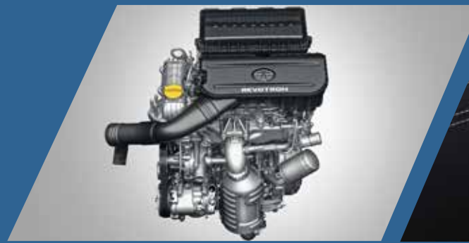
Max Power-86 ps @ 6000 r/min

Who says a peppy drive can't be thrilling? The Advanced AMT Transmission of Tiago lets you zip through any road without shifting a gear. The 1.2 L Revotron BS6 petrol engine with the power of 86 ps @ 6000 r/min gives you an all-round performance.