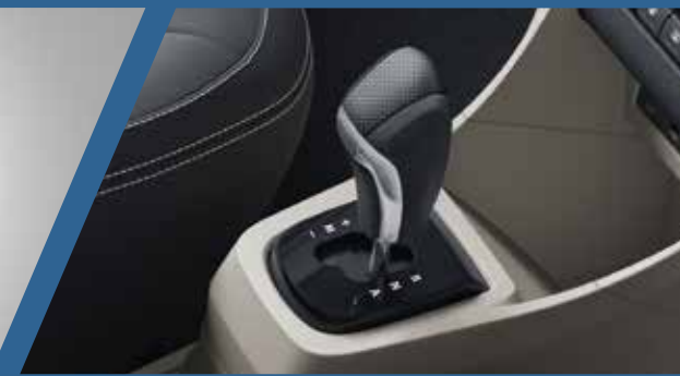
Advance AMT Transmission