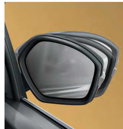
AUTO FOLD ORVM WITH WELCOME FUNCTION