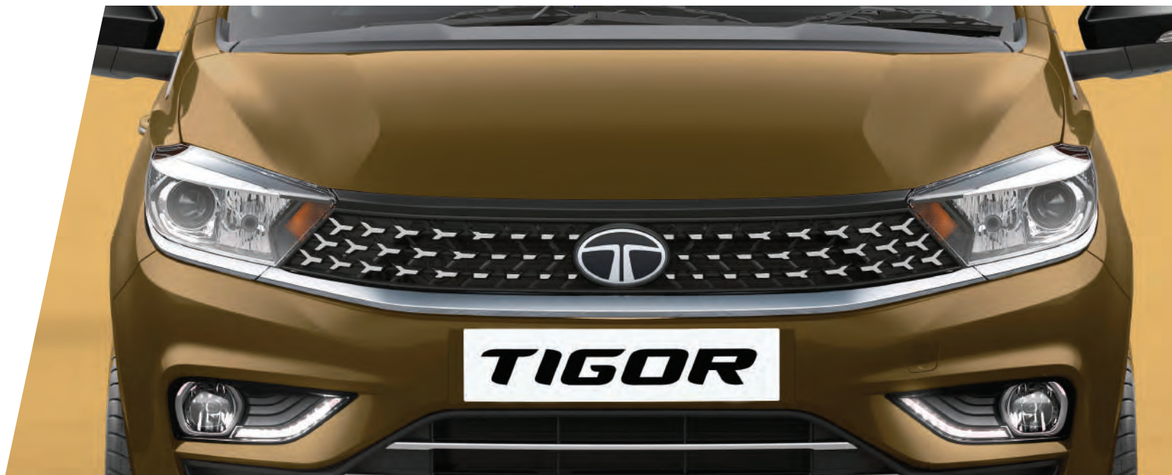
STYLISH CHROMED TRI-ARROW FRONT GRILLE