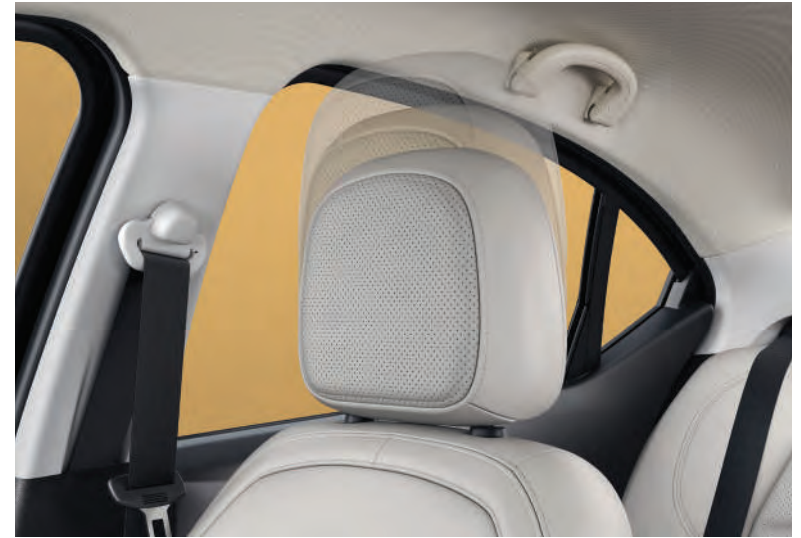
FRONT ADJUSTABLE HEADREST