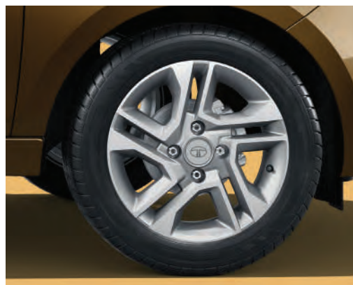
R15 SONIC SILVER ALLOY WHEELS