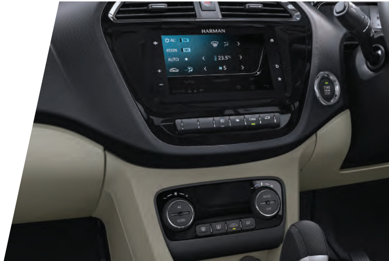
FULLY AUTOMATIC TEMPERATURE CONTROL