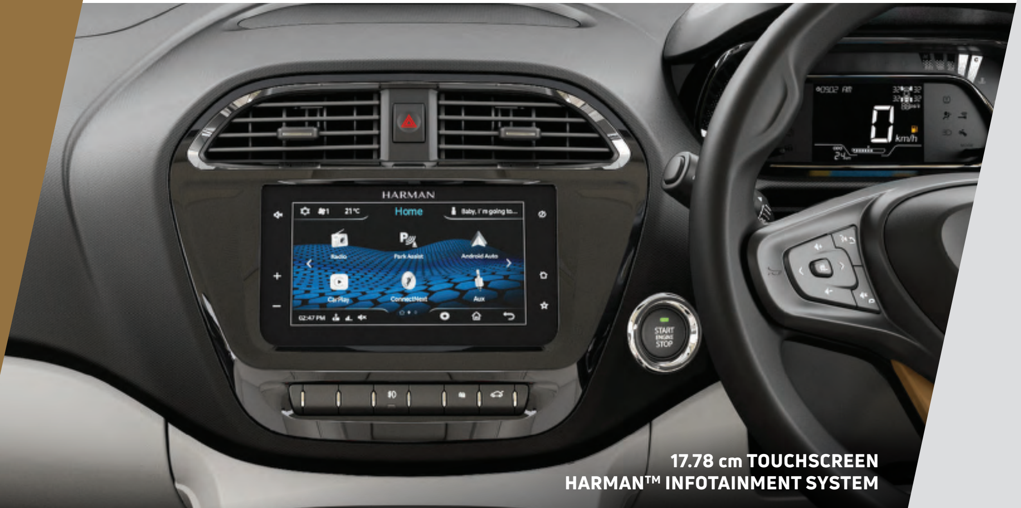
17.78 cm TOUCHSCREEN HARMAN™ INFOTAINMENT SYSTEM

Step into your space of superior entertainment with an Infotainment System that's backed by superior acoustics through 8 speakers to offer you an elevated entertainment experience. Control your beats conveniently, right at your fingertips.