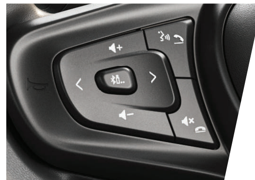
STEERING MOUNTED CONTROLS