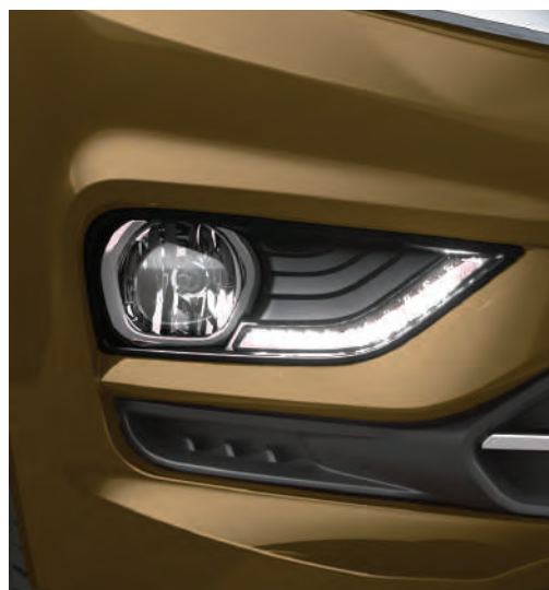
FRONT FOG LAMPS WITH CHROME RING SURROUNDS