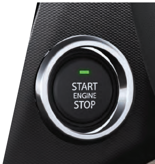
PUSH BUTTON START