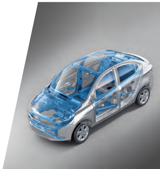
ENERGY ABSORBING BODY STRUCTURE