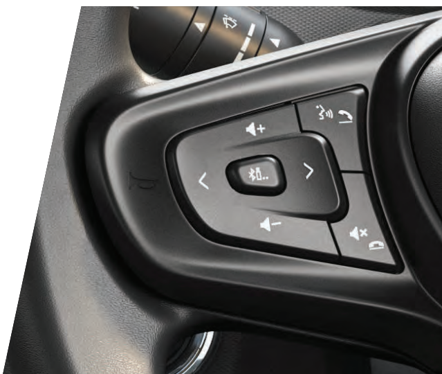
STEERING MOUNTED CONTROLS