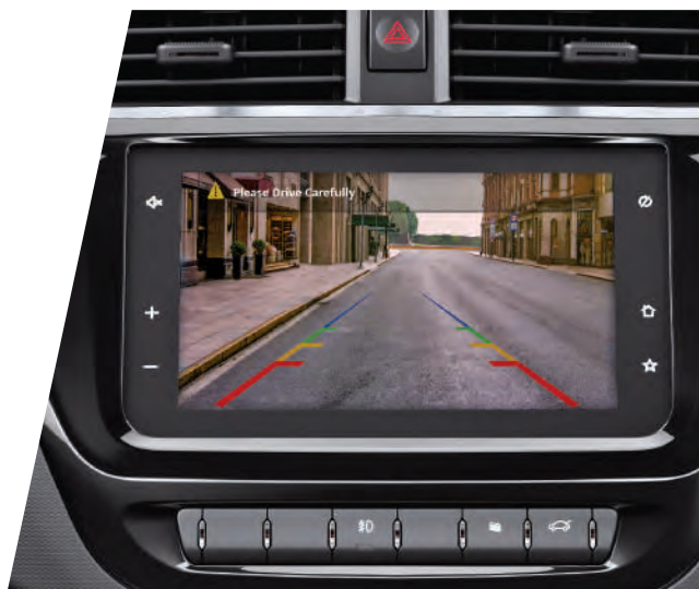
REVERSE PARKING ASSIST WITH CAMERA AND REAR PARKING SENSOR