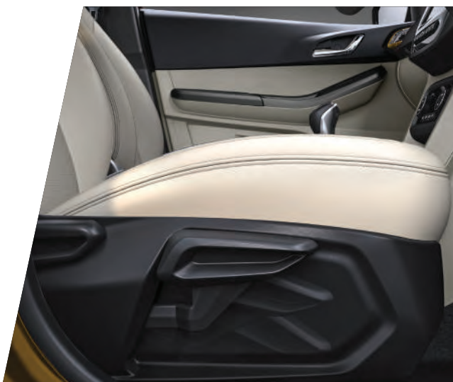
HEIGHT ADJUSTABLE DRIVER SEAT