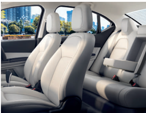
PREMIUM BENECKE KALIKO™ LEATHERETTE SEATS