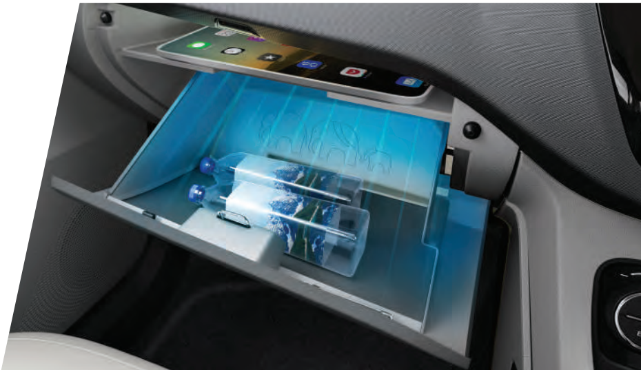
COOLED GLOVE BOX