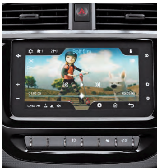
IMAGE & VIDEO PLAYBACK