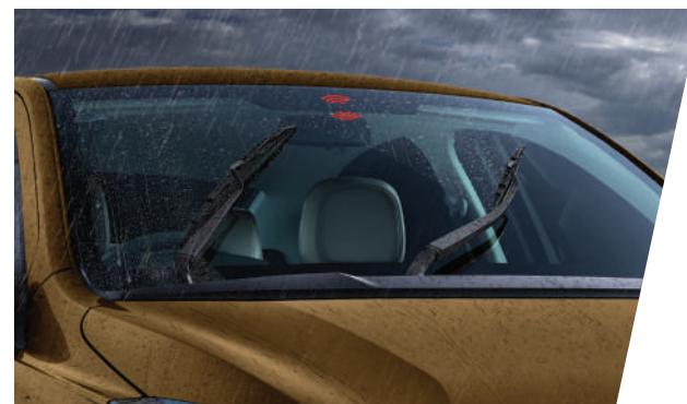
RAIN SENSING WIPERS