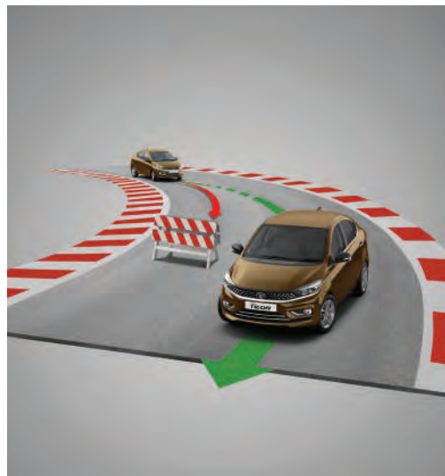
ABS WITH EBD AND CORNER STABILITY CONTROL