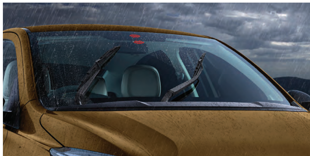
RAIN SENSING WIPERS