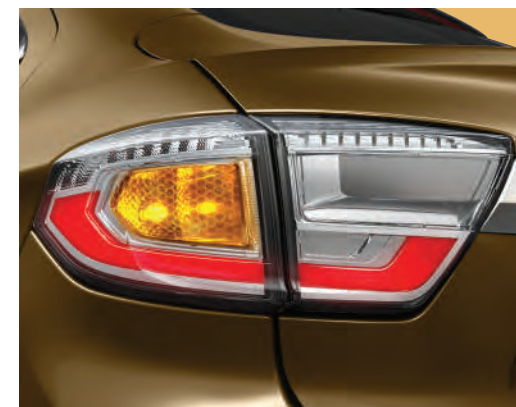
BOLD & BRIGHT LED TAIL LAMPS