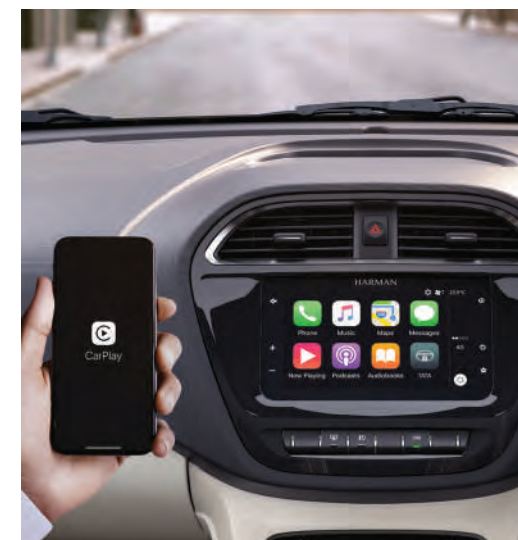
APPLE CARPLAY™ & ANDROID AUTO™