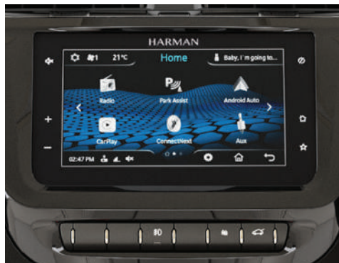
17.78 cm TOUCHSCREEN HARMAN™ INFOTAINMENT SYSTEM