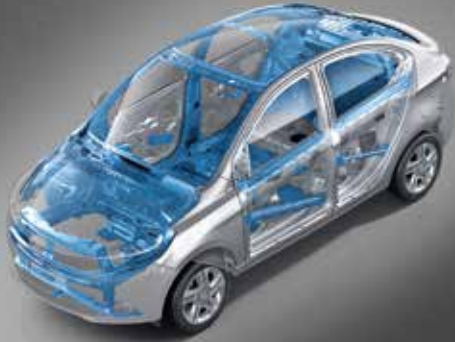
ENERGY ABSORBING STRUCTURE