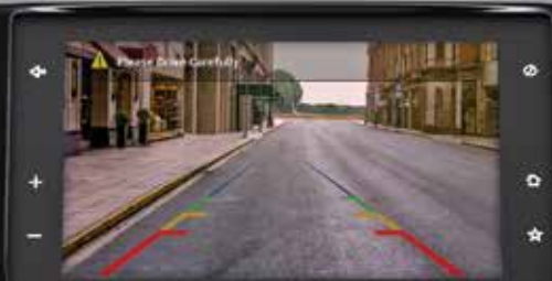
REAR PARKING ASSIST WITH CAMERA