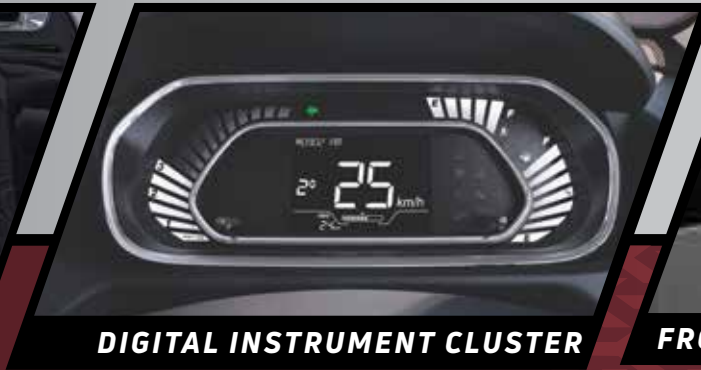
DIGITAL INSTRUMENT CLUSTER