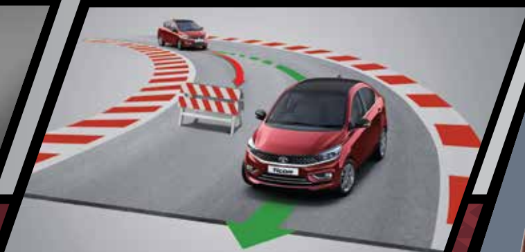
ABS WITH EBD AND CORNER STABILITY CONTROL