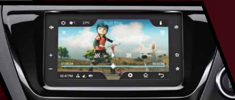
IMAGE & VIDEO PLAYBACK