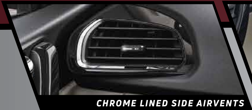
CHROME LINED SIDE AIRVENTS