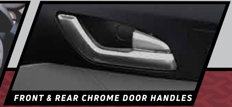
FRONT & REAR CHROME DOOR HANDLES