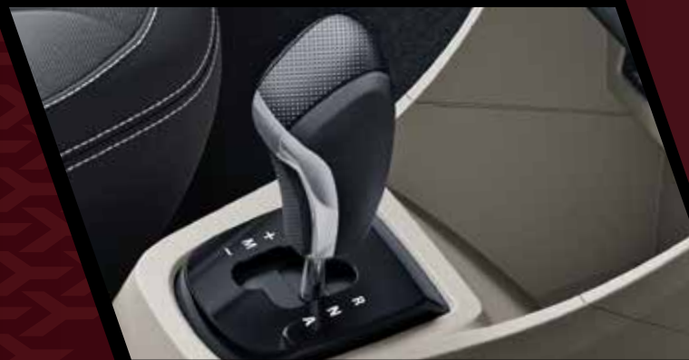
ADVANCE AMT TRANSMISSION