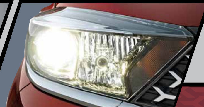
AUTOMATIC PROJECTOR HEADLAMPS