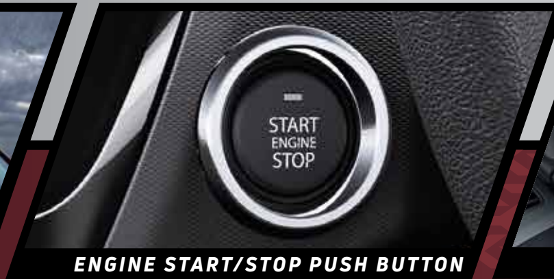
ENGINE START/STOP PUSH BUTTON