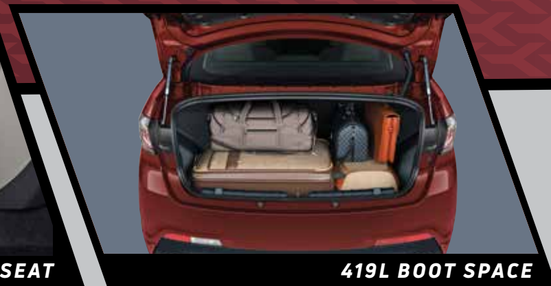
419L BOOT SPACE