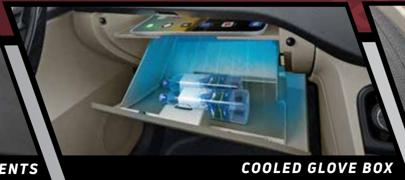
COOLED GLOVE BOX