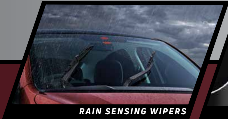
RAIN SENSING WIPERS