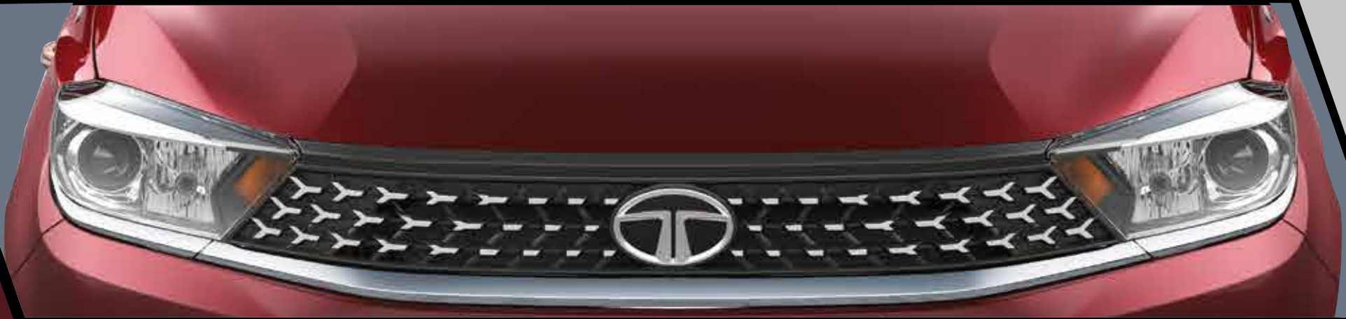
STYLISH CHROMED TRI-ARROW FRONT GRILLE