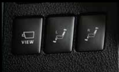
ONE TOUCH CONTROLS FOR PANORAMIC VIEW & SEATS