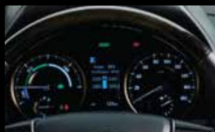
TYRE PRESSURE MONITORING SYSTEM (TPMS)

The Vellfire is uncompromisingly built with cutting-edge safety technology. VDIM: Vehicle Dynamics Integrated Management Systems, provide smooth, safe and predictable driving dynamics. It seamlessly coordinates ABS, BA, TRC & VSC proactively. Additionally equipped with 7 SRS Airbags*, Panoramic View Monitor and Tyre Pressure Monitoring System, the Vellfire, ensures ultimate safety while you forge ahead.