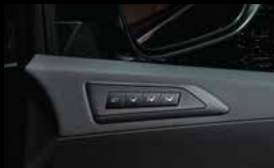
POWERED SEATS WITH MEMORY FUNCTION