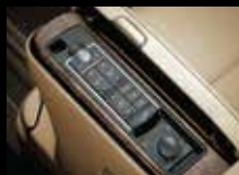
LOUNGE COMMAND CENTRE