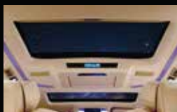
MESMERIZING DUAL SUNROOF