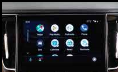
APPLE CARPLAY & ANDROID AUTO, SMARTDEVICELINK