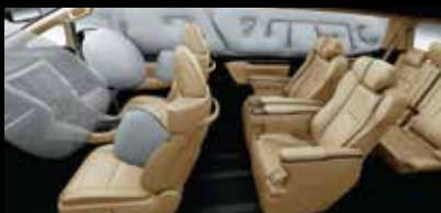
7 SRS AIRBAGS*