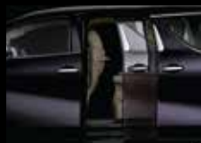
POWERED SLIDING DOORS

Unwind in your enclosed private suite crafted to luxuriate.