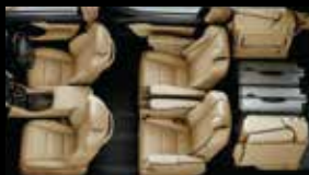
SUITE ON THE GO