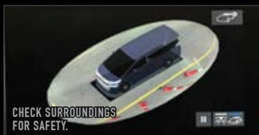
PANORAMIC VIEW MONITOR