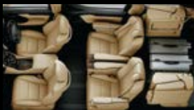
SUITE ON THE GO