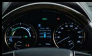
TYRE PRESSURE MONITORING SYSTEM (TPMS)

The Vellfire is uncompromisingly built with cutting-edge safety technology. VDIM: Vehicle Dynamics Integrated Management Systems, provide smooth, safe and predictable driving dynamics. It seamlessly coordinates ABS, BA, TRC & VSC proactively. Additionally equipped with 7 SRS Airbags*, Panoramic View Monitor and Tyre Pressure Monitoring System, the Vellfire, ensures ultimate safety while you forge ahead.