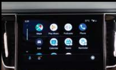
APPLE CARPLAY & ANDROID AUTO, SMARTDEVICELINK