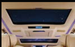
MESMERIZING DUAL SUNROOF