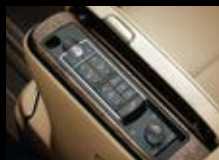
LOUNGE COMMAND CENTRE