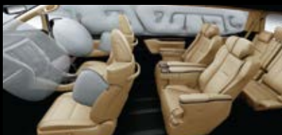
7 SRS AIRBAGS*