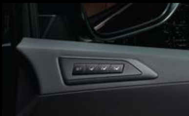
POWERED SEATS WITH MEMORY FUNCTION