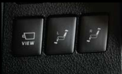
ONE TOUCH CONTROLS FOR PANORAMIC VIEW & SEATS