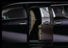
POWERED SLIDING DOORS

Unwind in your enclosed private suite crafted to luxuriate.