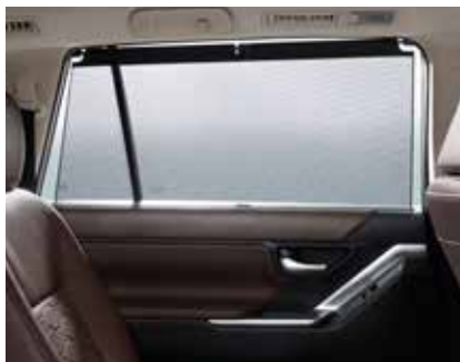
FIRST-IN-SEGMENT Rear Sunshade