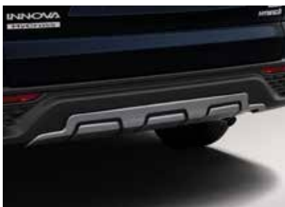
Rear Under Run