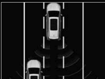
Blind Spot Monitor (BSM)