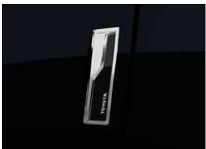
Door Edge Protector

*This is only a key list of accessories, please check with your dealer for more options.