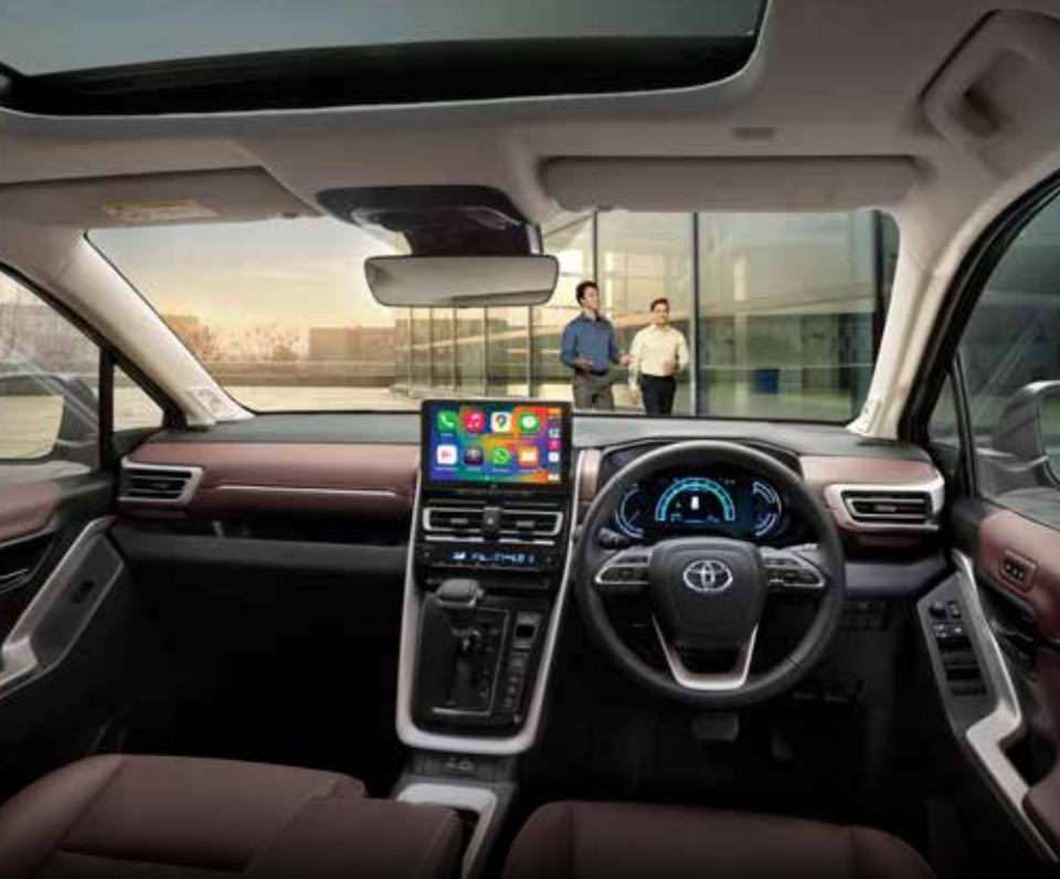
Dark Chestnut Dual Tone Dashboard with Soft Touch Instrument Panel