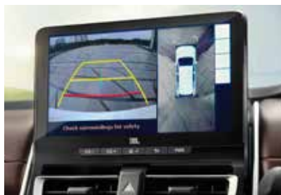
360° Camera View*