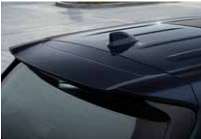
Sporty Roof Spoiler