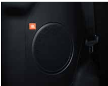
9 Speaker JBL System (Including Subwoofer)