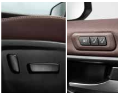
8-Way Powered Driver Seat with Memory Function