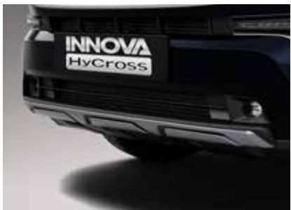
Front Under Run