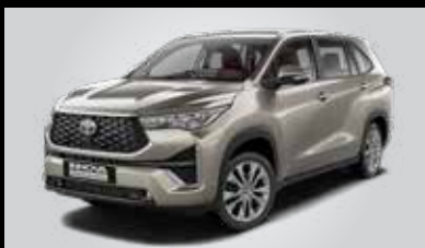
Avant-garde Bronze Metallic