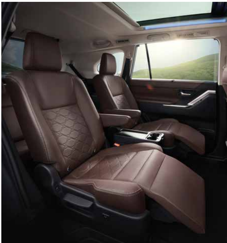
FIRST-IN-SEGMENT Powered Ottoman Seats with Long Slide