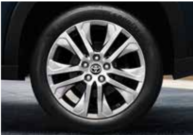
R18 (45.72 cm) Super Chrome Alloy Wheels