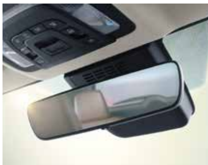
FIRST-IN-SEGMENT Electrochromic IRVM