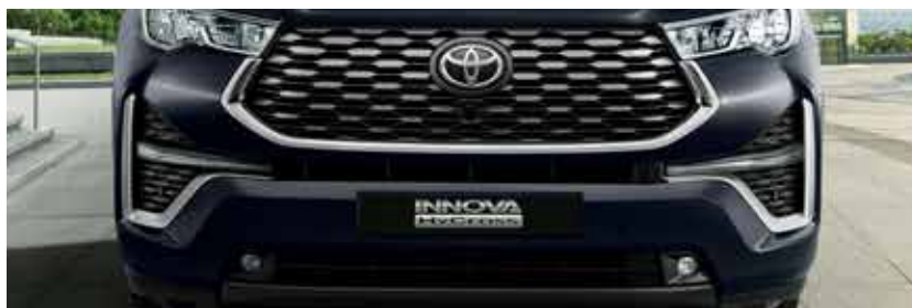
Imposing Grille & Bumper