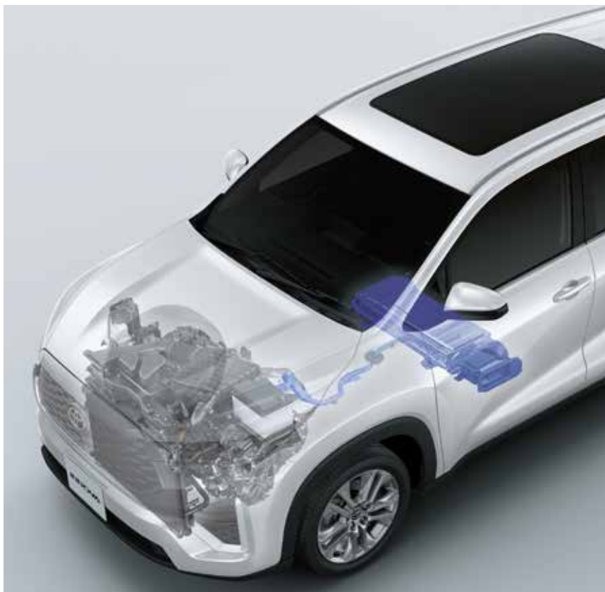
5 th Generation Self-charging Hybrid Electric Technology