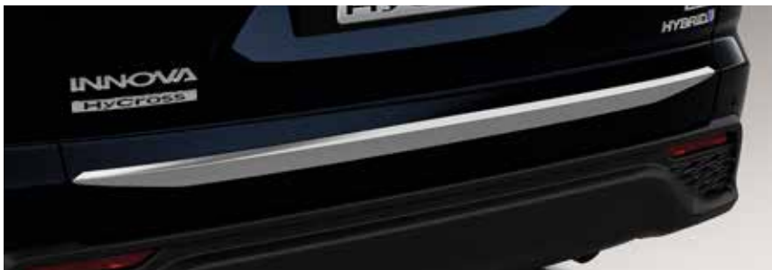
Rear Door Lid Garnish