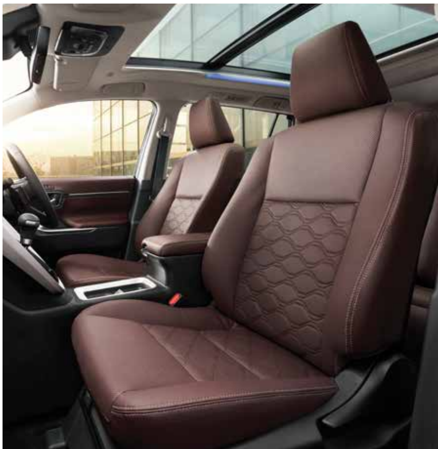
Quilted Dark Chestnut Leather Seats