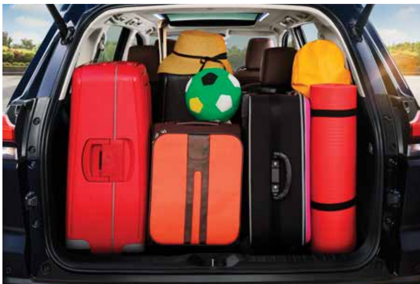
Tilt Down Split Seats/Flat Fold Seats