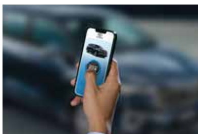
Find My Car*