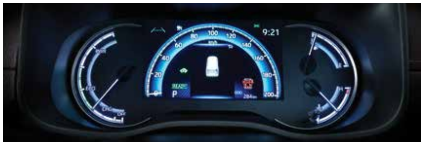
17.8 cm TFT Instrument Cluster