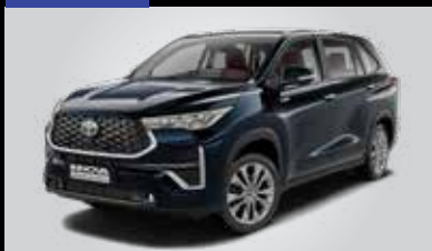
Blackish Ageha Glass Flake