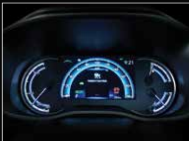
Dynamic Radar Cruise Control