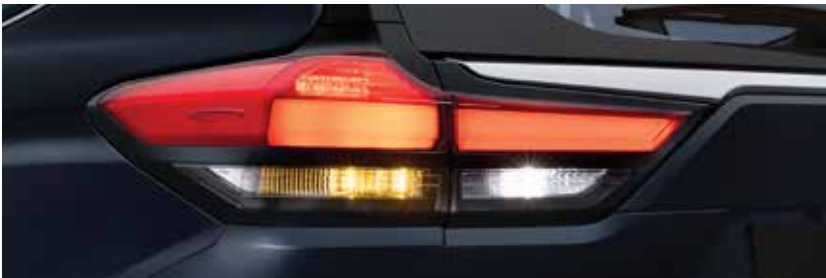
Surface Emitting LED Tail Lamps