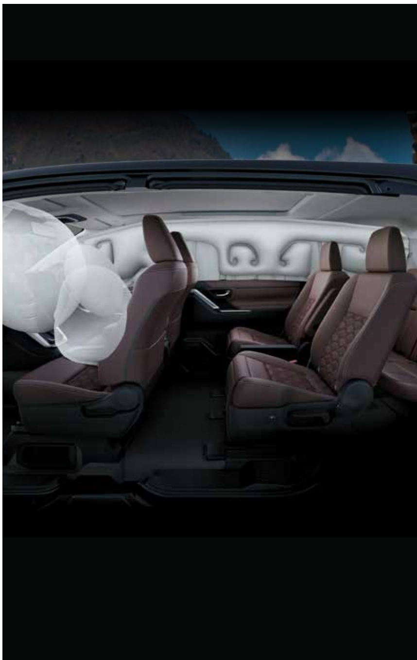
6 SRS Airbags #

# For more details on the functioning of airbags, please refer to the owner's manual.