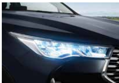
Tri-Eye LED Headlamps