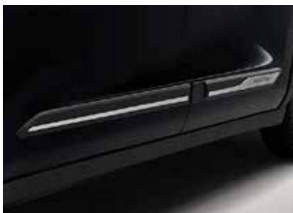
Side P Mold