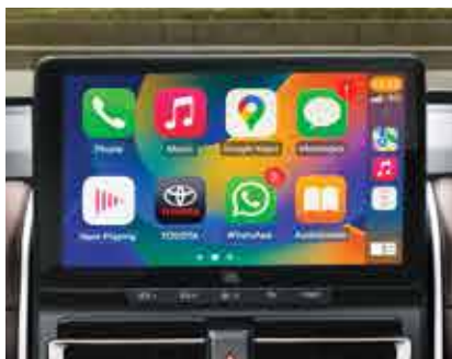
25.62 cm Connected Touchscreen Audio