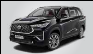
Sparkling Black Pearl Crystal Shine