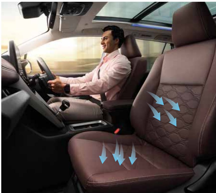
FIRST-IN-SEGMENT Ventilated Seats