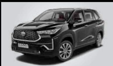
Attitude Black Mica