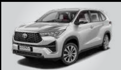
Platinum White Pearl