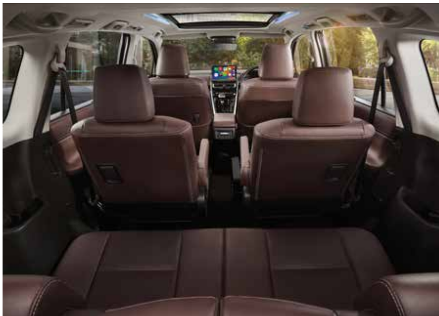
Spacious Cabin with Comfortable 3rd Row Seats