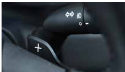
FIRST-IN-SEGMENT Paddle Shifters