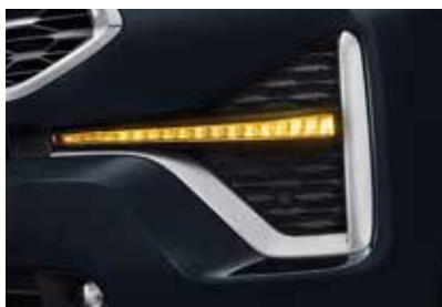
FIRST-IN-SEGMENT Dual Function [DRL + Indicator]