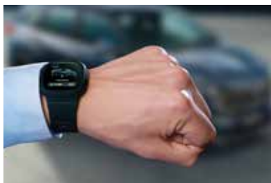
Remote AC Control*