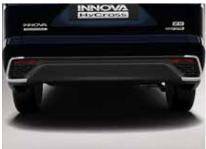
Rear Reflector Garnish