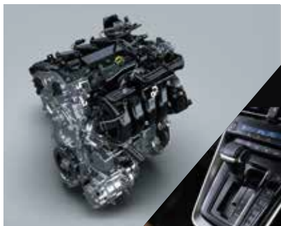
FIRST-IN-SEGMENT TNGA Hybrid Petrol Engine with E-drive Transmission