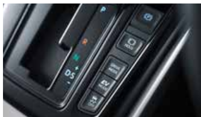
Drive Mode Switch