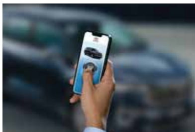
Remote Vehicle Ignition Start/ Stop*