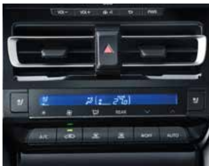
FIRST-IN-SEGMENT Multi-zone AC (Front & Rear)