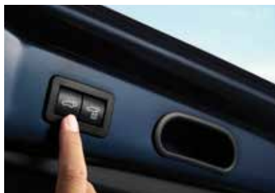
FIRST-IN-SEGMENT Power Back Door