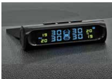
Tyre Pressure Monitoring System*