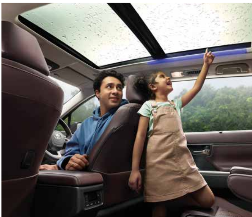
Panoramic Sunroof with Mood Lighting and Roof Mounted AC Vents