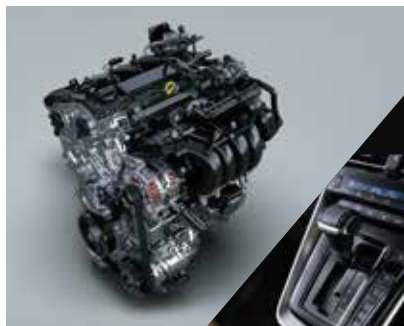
TNGA Petrol Engine with Direct Shift CVT