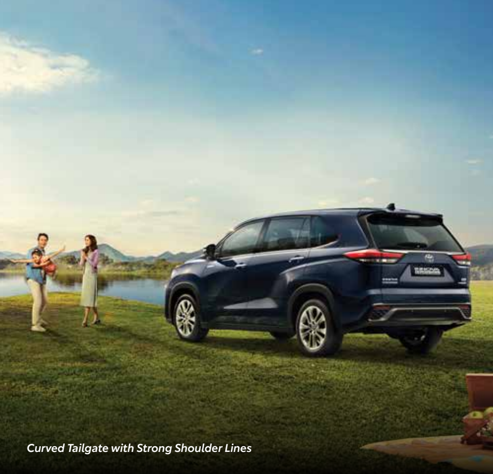
Curved Tailgate with Strong Shoulder Lines