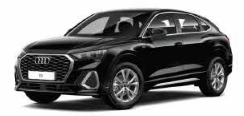
Mythos Black, Metallic