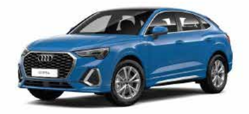
Turbo Blue, Solid

Pick the ideal shade for your Audi Q3 Sportback from our exclusive range of colours.