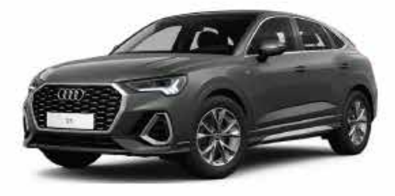
Chronos Grey, Metallic