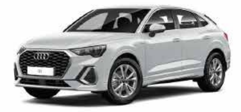
Glacier White, Metallic