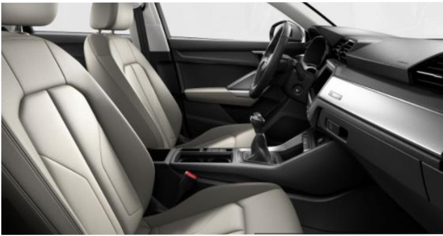
Okapi Brown Pearl Beige