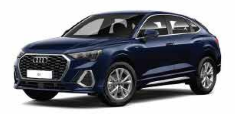
Navarra Blue, Metallic