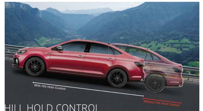
HILL HOLD CONTROL