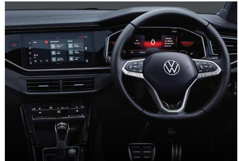
DUAL TONE DASHBOARD