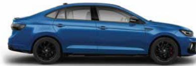
RISING BLUE METALLIC