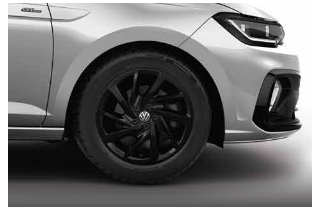
BLACK ALLOY WHEELS