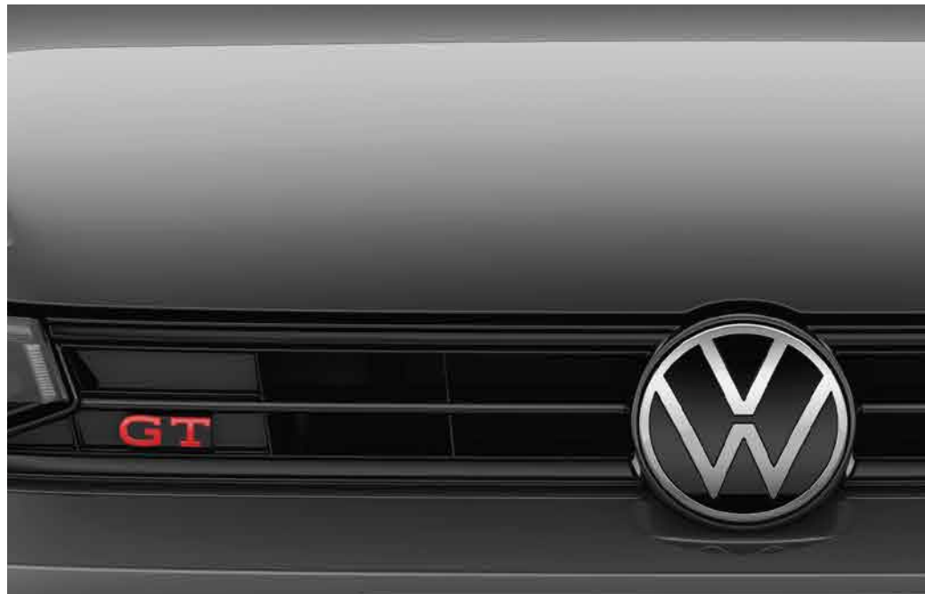
BLACK GLOSSY FRONT GRILLE