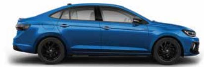
RISING BLUE METALLIC