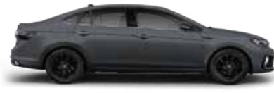
CARBON STEEL GREY MATTE