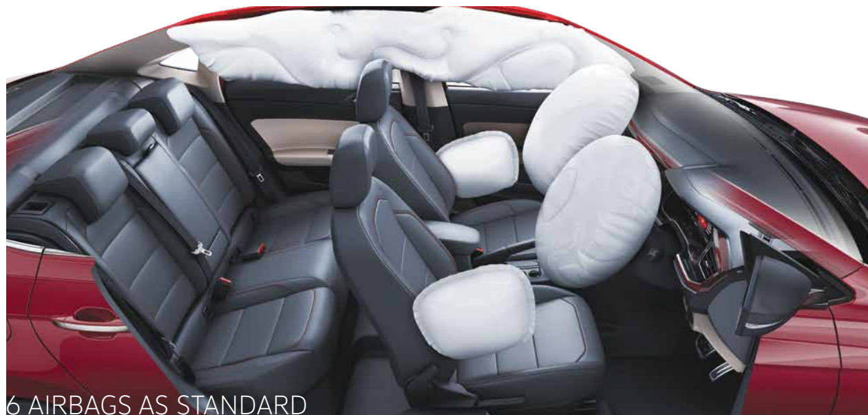
6 AIRBAGS AS STANDARD