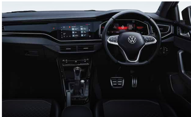
GLOSSY BLACK DASHBOARD