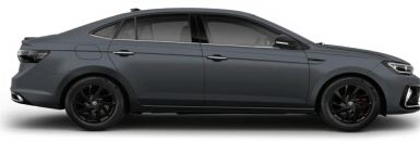
CARBON STEEL GREY MATTE