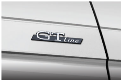
GT LINE BADGE