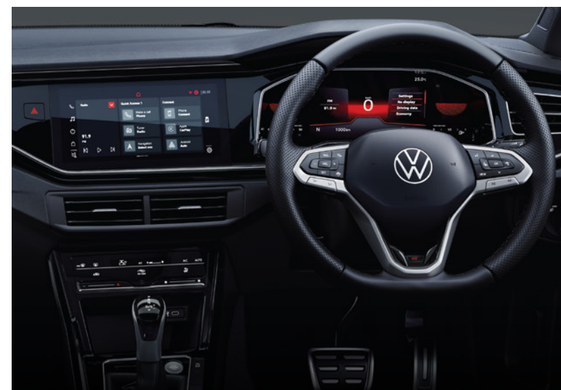
DUAL TONE DASHBOARD