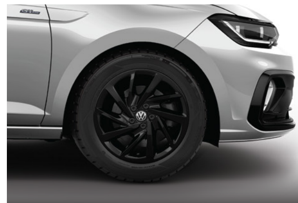
BLACK ALLOY WHEELS