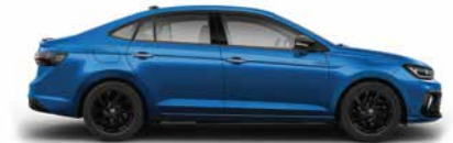
RISING BLUE METALLIC