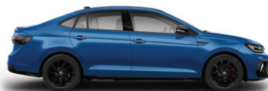
RISING BLUE METALLIC