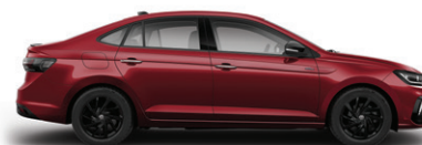
WILD CHERRY RED