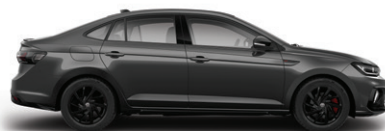
CARBON STEEL GREY