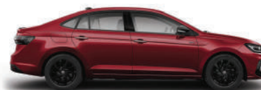
WILD CHERRY RED