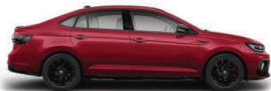
WILD CHERRY RED