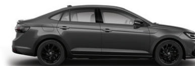
CARBON STEEL GREY