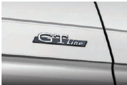
GT LINE BADGE