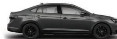
CARBON STEEL GREY