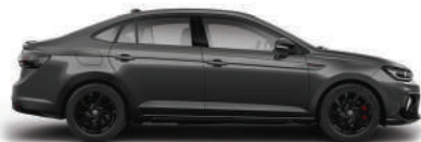
CARBON STEEL GREY