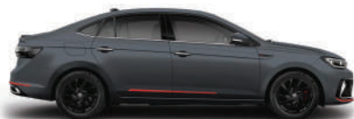
CARBON STEEL GREY MATTE