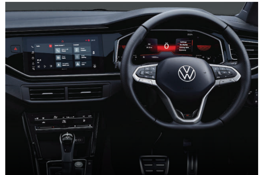
DUAL TONE DASHBOARD