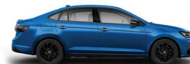
RISING BLUE METALLIC