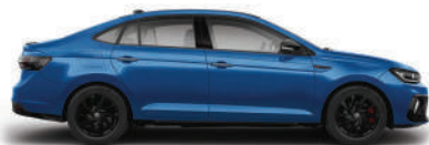
RISING BLUE METALLIC