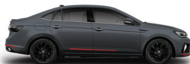
CARBON STEEL GREY MATTE