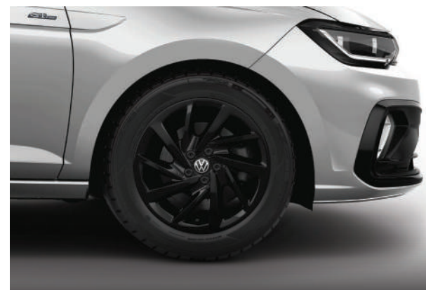
BLACK ALLOY WHEELS