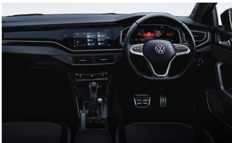
GLOSSY BLACK DASHBOARD