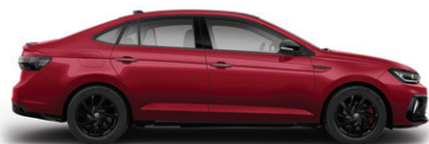
WILD CHERRY RED