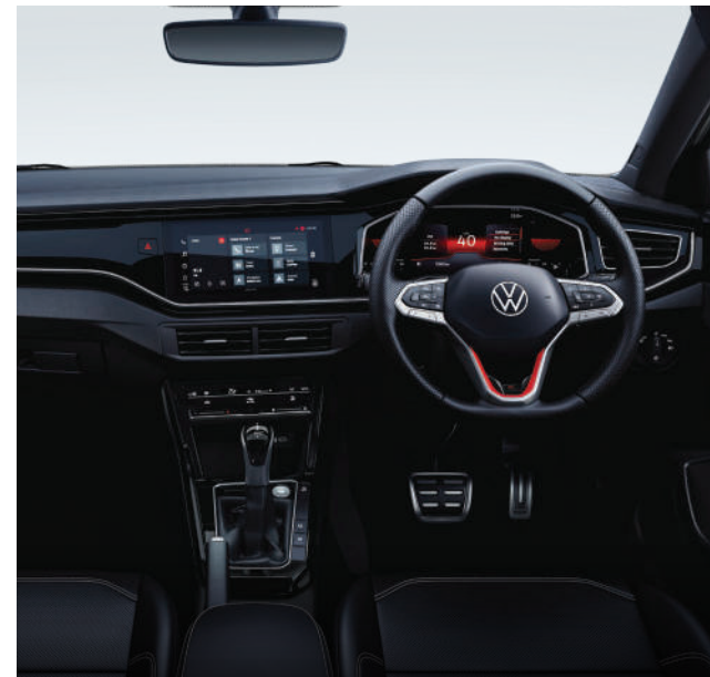
GLOSSY BLACK DASHBOARD