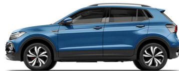
RISING BLUE METALLIC