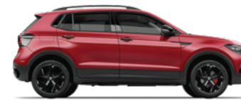
WILD CHERRY RED