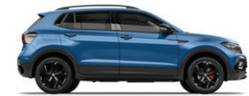
RIISING BLUE METALLIC