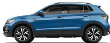
RISING BLUE METALLIC