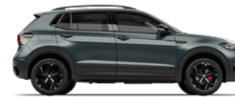
CARBON STEEL GREY