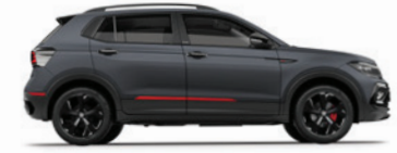
CARBON STEEL GREY MATTE