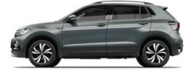
CARBON STEEL GREY