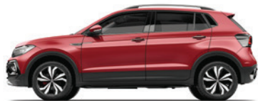
WILD CHERRY RED

GT is more than just a badge, it's a testament to the top-notch German-engineering and powerful performance of Taigun. The striking, bold design makes a statement with Chrome plaque with GT branding on the front fender, grille, and rear; GT welcome message on infotainment, Laser Red Ambient Lighting, Wild Cherry Red Stitching, Amrur Grey Classy Décor, Red Painted Caliper in Front, R17 Manila Alloy Wheels in dual tone and Dual tone leatherette seat upholstery with Red stitching.