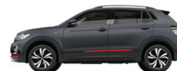
CARBON STEEL GREY MATTE