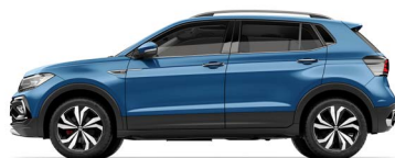
RISING BLUE METALLIC