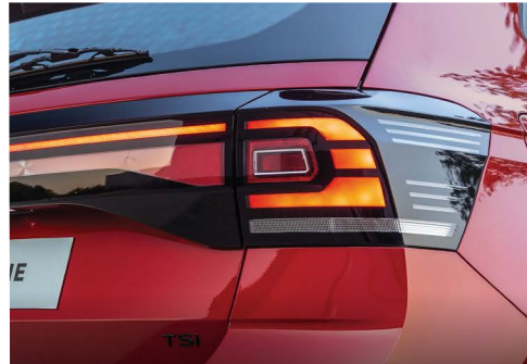
INFINITY TAIL LAMPS