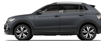
CARBON STEEL GREY MATTE