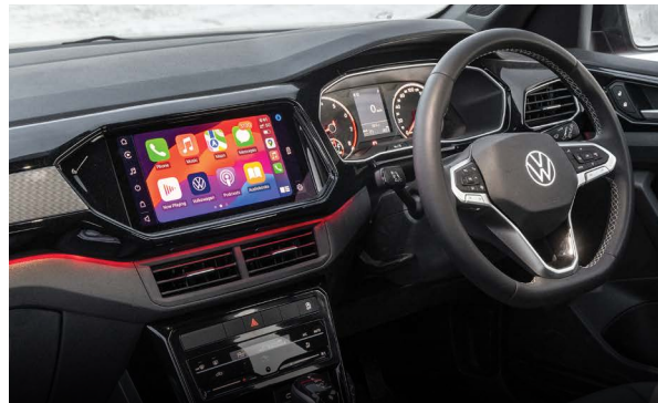
GLOSSY BLACK DASHBOARD