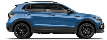
RISING BLUE METALLIC