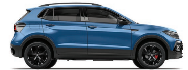
RIISING BLUE METALLIC