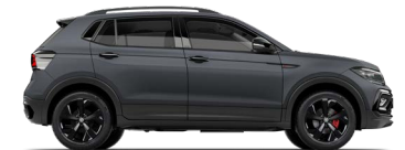
CARBON STEEL GREY MATTE