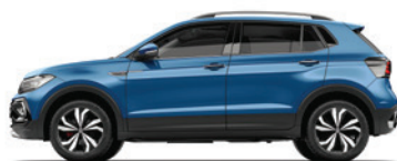
RISING BLUE METALLIC