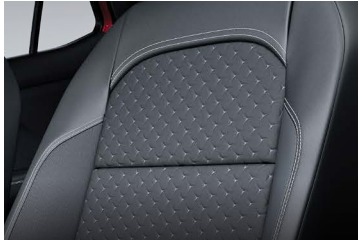
LONDON GREY STITCHING