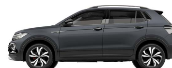
CARBON STEEL GREY MATTE