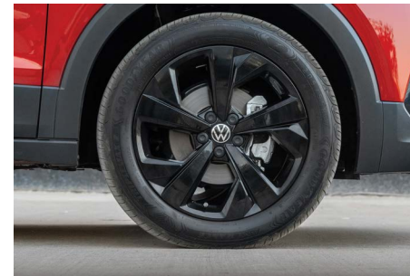
BLACK ALLOY WHEELS