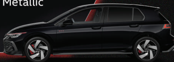
Grenadilla Black Metallic