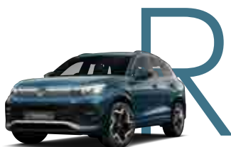
NIGHTSHADE BLUE METALLIC