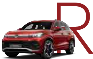
PERSIMMON RED METALLIC