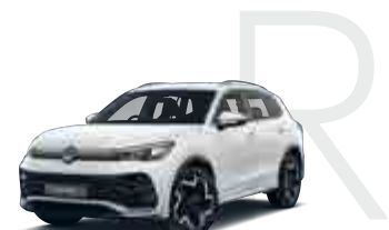
ORYX WHITE MOTHER-OF-PEARL EFFECT