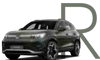
CIPRESSINO GREEN METALLIC