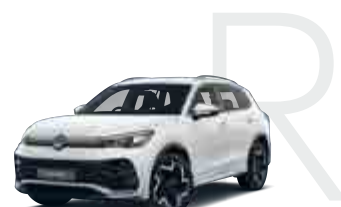
ORYX WHITE MOTHER-OF-PEARL EFFECT