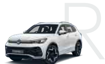
ORYX WHITE MOTHER-OF-PEARL EFFECT