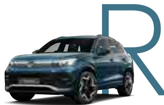
NIGHTSHADE BLUE METALLIC