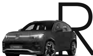
GRENADILLA BLACK METALLIC