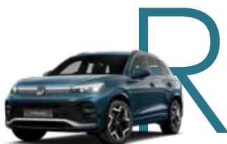
NIGHTSHADE BLUE METALLIC