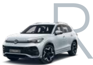
OYSTER SILVER METALLIC