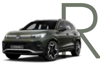
CIPRESSINO GREEN METALLIC