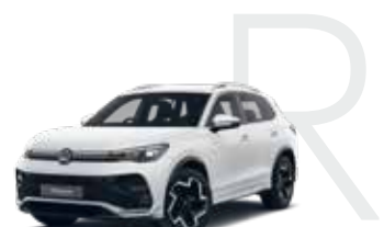
ORYX WHITE MOTHER-OF-PEARL EFFECT