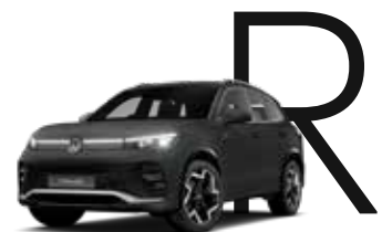
GRENADILLA BLACK METALLIC