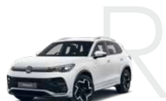
ORYX WHITE MOTHER-OF-PEARL EFFECT