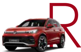
PERSIMMON RED METALLIC