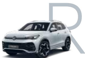
OYSTER SILVER METALLIC