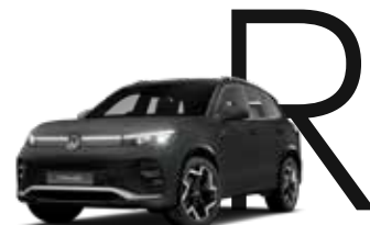
GRENADILLA BLACK METALLIC