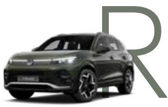
CIPRESSINO GREEN METALLIC