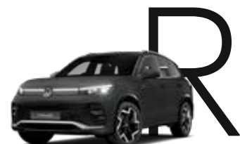
GRENADILLA BLACK METALLIC