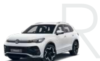
ORYX WHITE MOTHER-OF-PEARL EFFECT