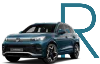
NIGHTSHADE BLUE METALLIC