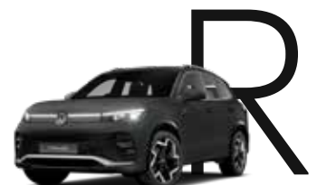
GRENADILLA BLACK METALLIC