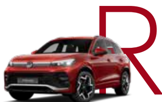
PERSIMMON RED METALLIC