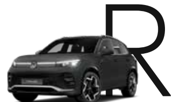
GRENADILLA BLACK METALLIC