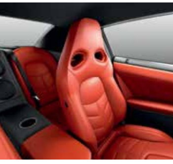
Black / Red Amber semi-aniline leather Prestige