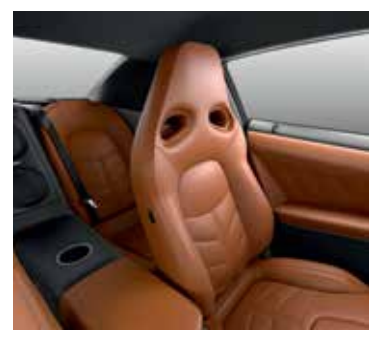
Black / Saddle Tan semi-aniline leather Prestige