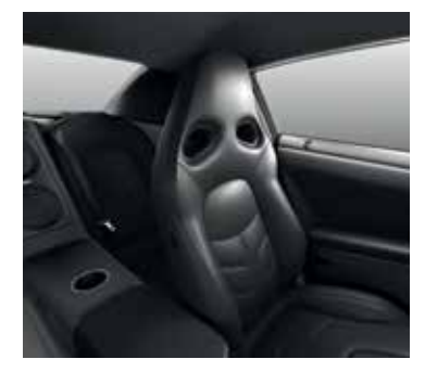
Black Samurai semi-aniline leather Prestige