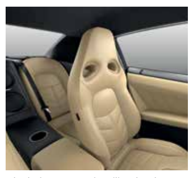
Black / Ivory semi-aniline leather Prestige