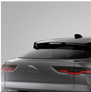
SPOILER OP- TIONS