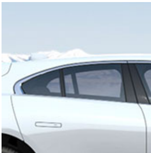
GLASS OP- TIONS