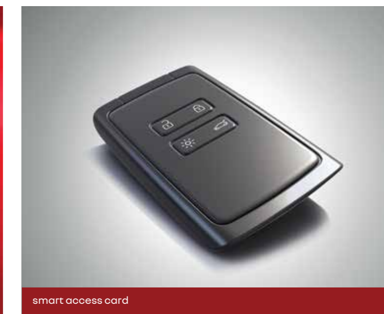
smart access card