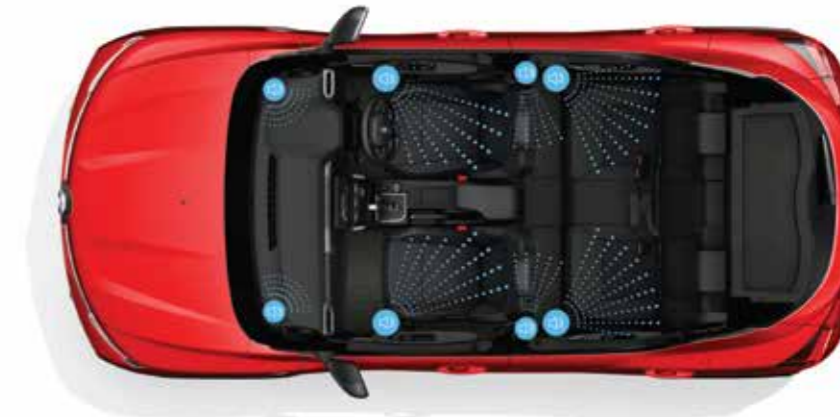
3D sound by ARKAMYS® (4 speakers + 4 tweeters)

The Renault KIGER's smart interiors are designed to make every trip memorable. It features Android Auto/Apple CarPlay with wireless smartphone replication and 3D sound by ARKAMYS® (4 speakers + 4 tweeters) for an exciting in-car entertainment experience. Smart technology inside continues in Push Start/Stop, Smart Access Card, rear view camera and Auto AC with a PM2.5 clean air filter.