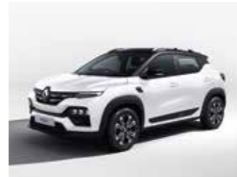
ice cool white