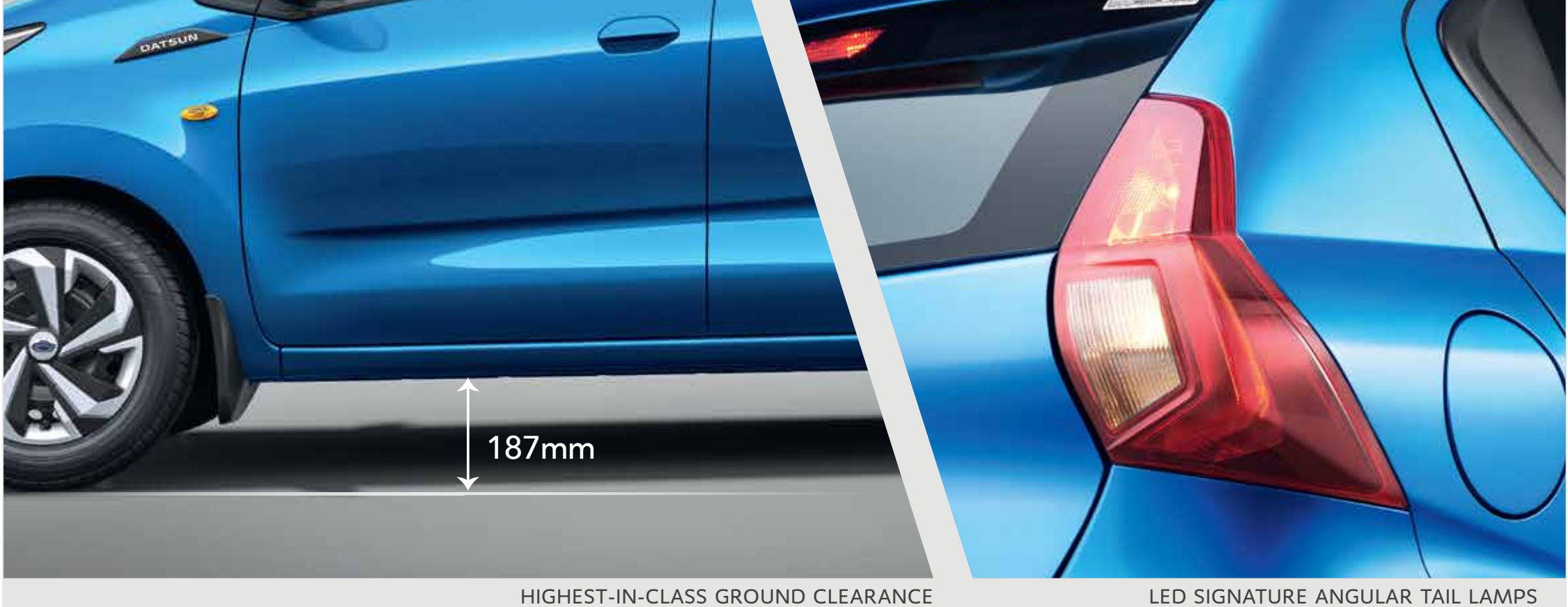
LED SIGNATURE ANGULAR TAIL LAMPS