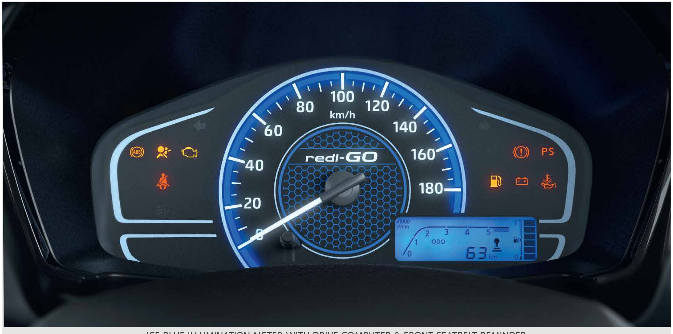
ICE BLUE ILLUMINATION METER WITH DRIVE COMPUTER & FRONT SEATBELT REMINDER