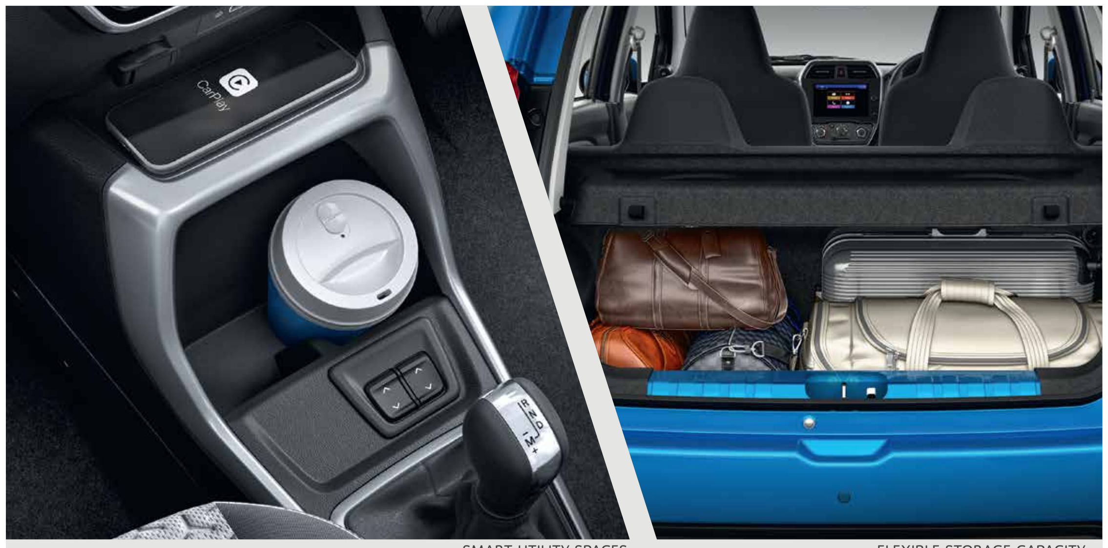
SMART UTILITY SPACES