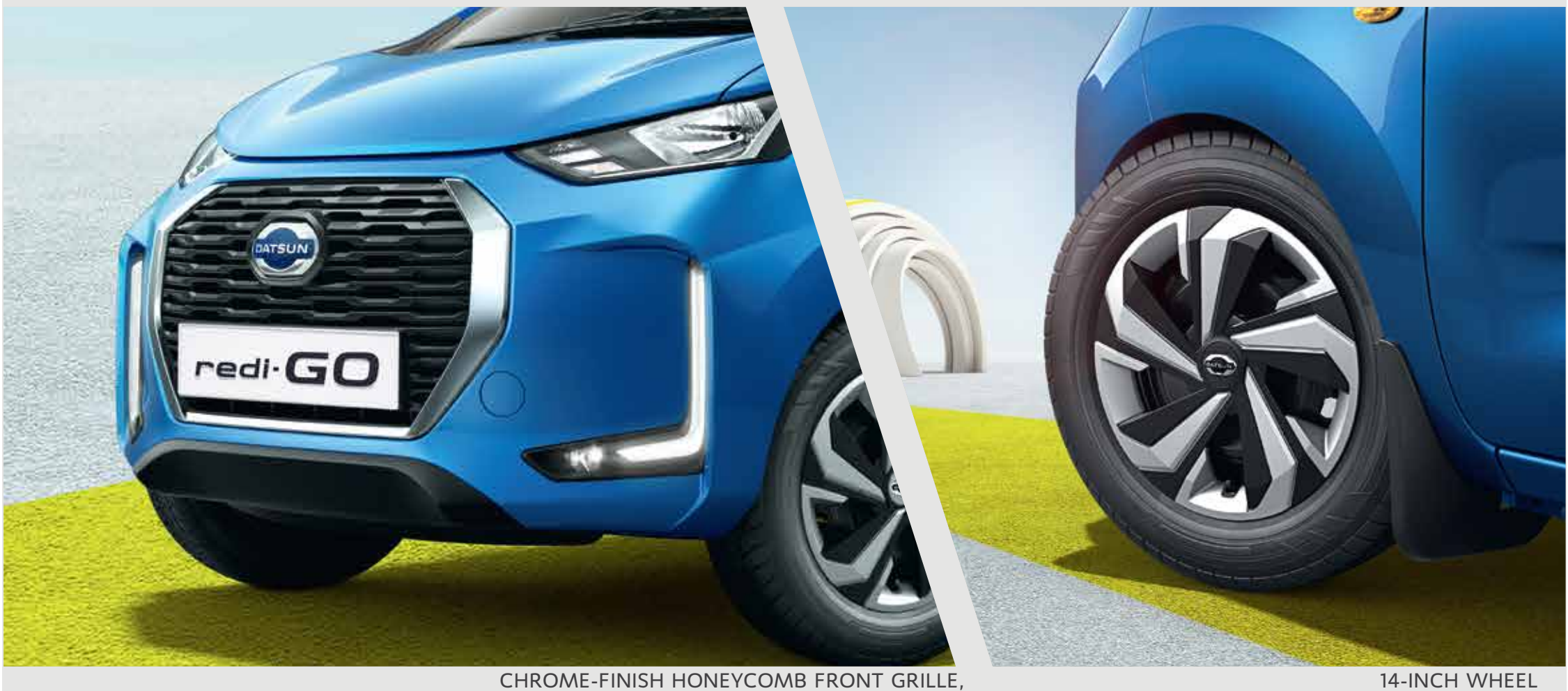
CHROME-FINISH HONEYCOMB FRONT GRILLE, DISTINCTIVE LED DRLS & LED FOG LAMPS

The new Datsun redi-GO takes a bold stance on the road with its new chrome-finish grille, LED Daytime Running Lamps and LED fog lamps. With best-in-class ground clearance, it's designed to take on every terrain with ease.