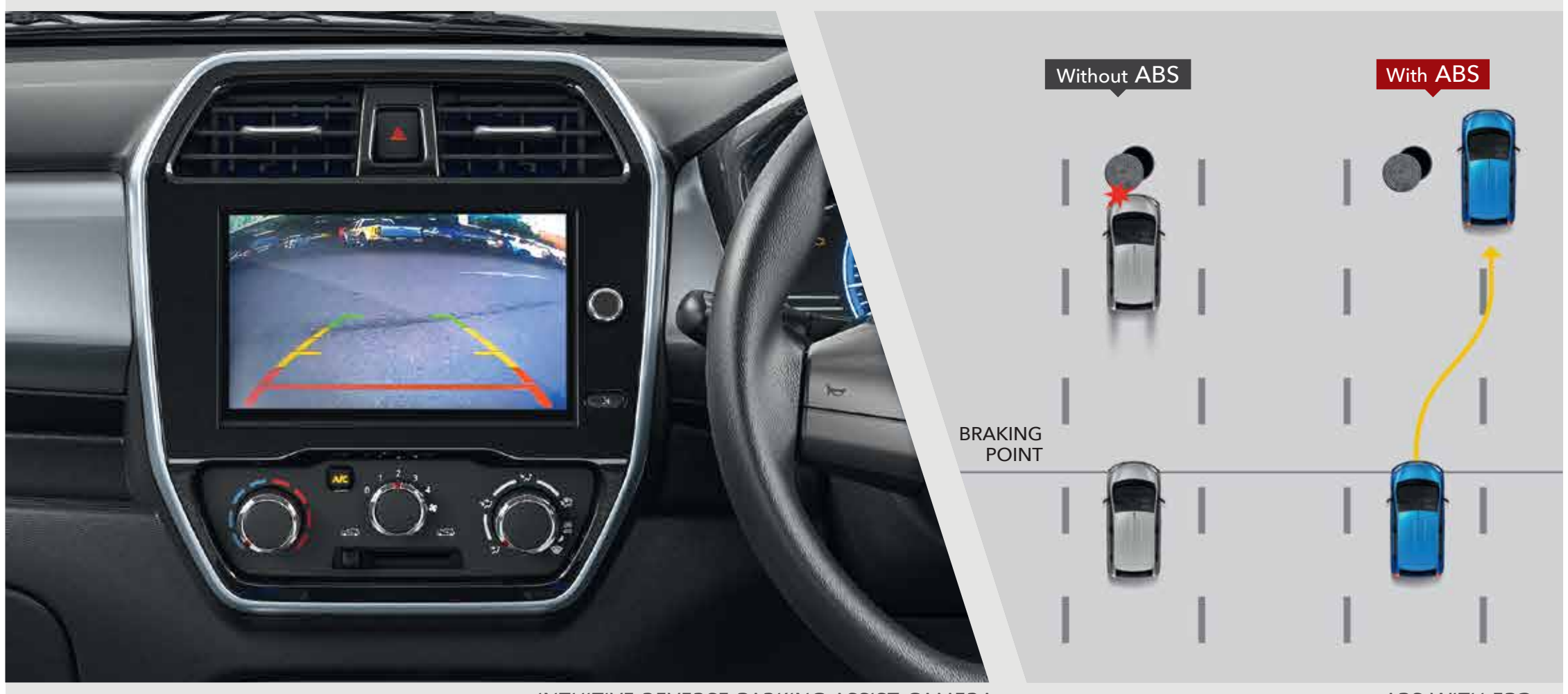
INTUITIVE REVERSE PARKING ASSIST CAMERA WITH PROJECTION GUIDE